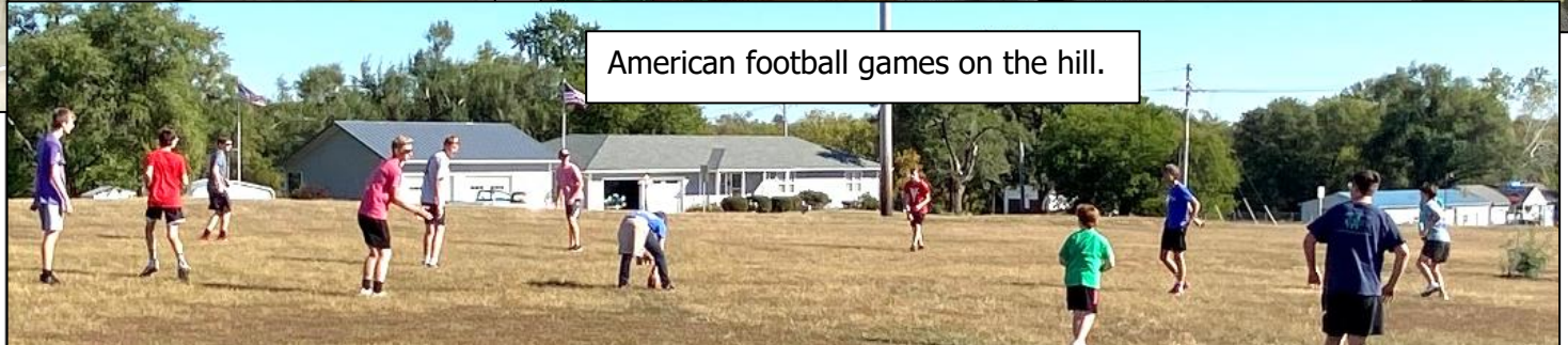
American football games on the hill.