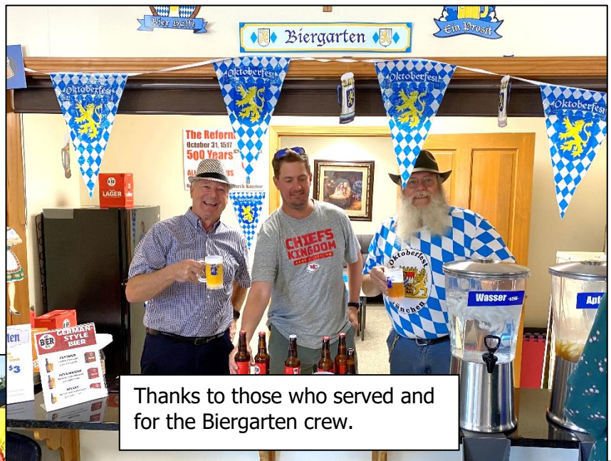
Thanks to those who served and for the Biergarten crew.