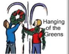
Hanging of the Greens

On Saturday, Nov. 26 before Advent, we'll be busy putting up the tall tree in the Nave and decorating. All are invited to help. We will start at 9:00 am, should be done by 10:30 am