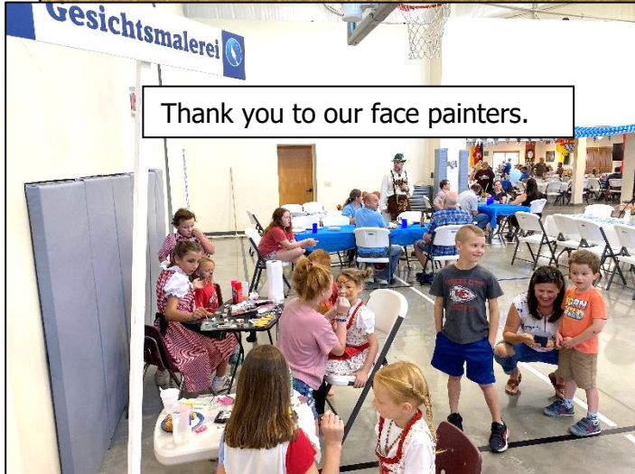
Thank you to our face painters.