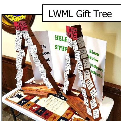
LWML Gift Tree

Pick-up Truck If you need to borrow a pickup truck, please contact Pastor Weinkauf.