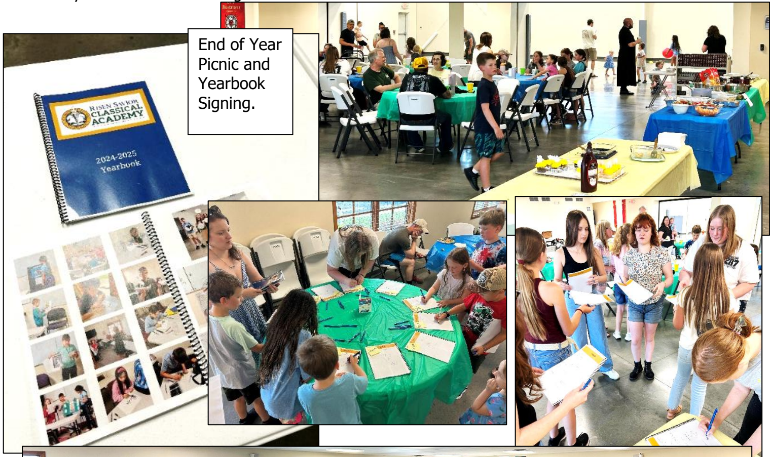
End of Year Picnic and Yearbook Signing.