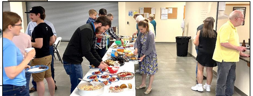
Book of Concord social time