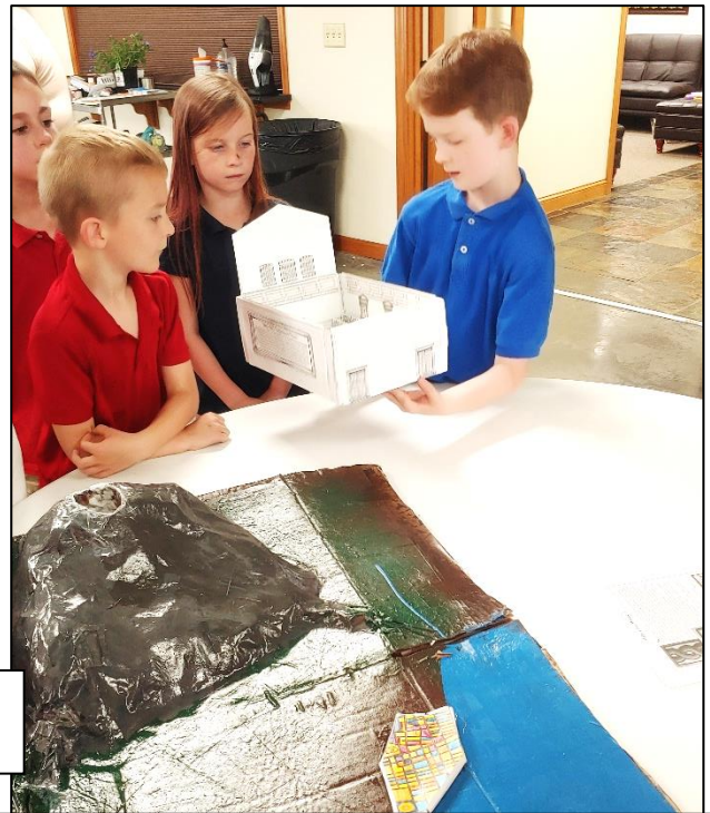
Some Katies Sisters trying to get out of the Escape Room