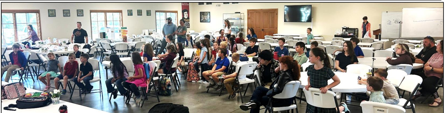
Ice Cream Party as we ended the school year, the House Cup and special prizes awarded.