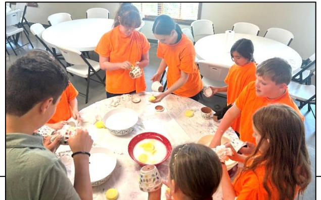
Art Class worked on mosaic tiles, grout work, and plantings for Mother's Day gift.