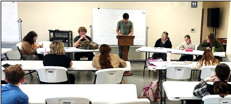
Epsilon and Omega Classes in Debate teams, judges.