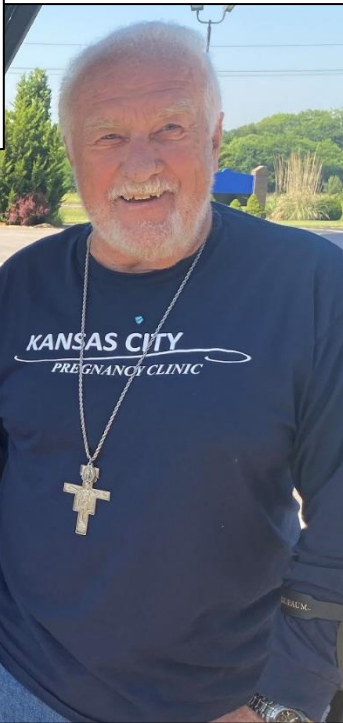
KC Pregnancy Clinic picking up the baby bottle collections. Thank you to all who helped with this outreach project as we joined Pro-life churches around the US collecting funds annually with baby bottle banks held between Mother's Day to Father's Day.