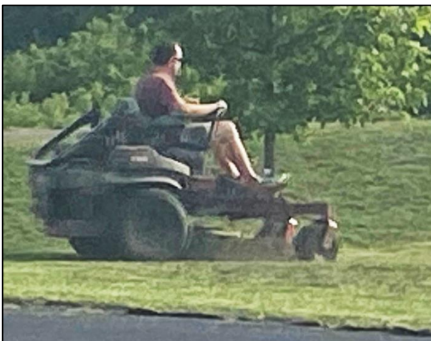
Thanks to our mowing teams. With our 2 large mowers it takes less than 2 hours and saves the church $thousands each summer.