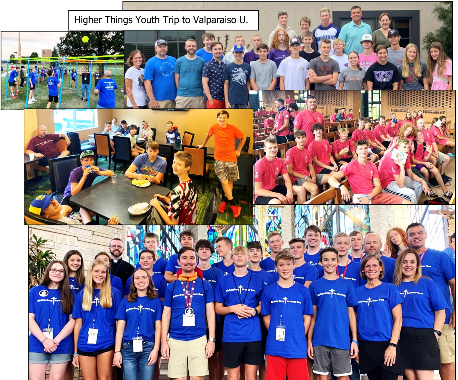
Higher Things Youth Trip to Valparaiso U.