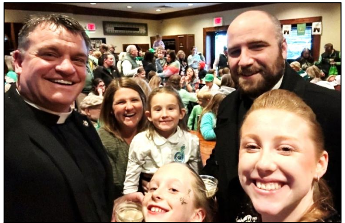
St. Patrick's Day. The Pastors ended up at an Irish Pub where some of our members were performing Irish Dance with their dance troupe.