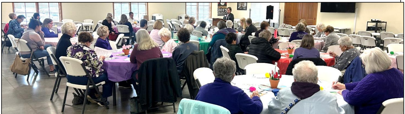
Our LWML hosted their regional event at Risen Savior.