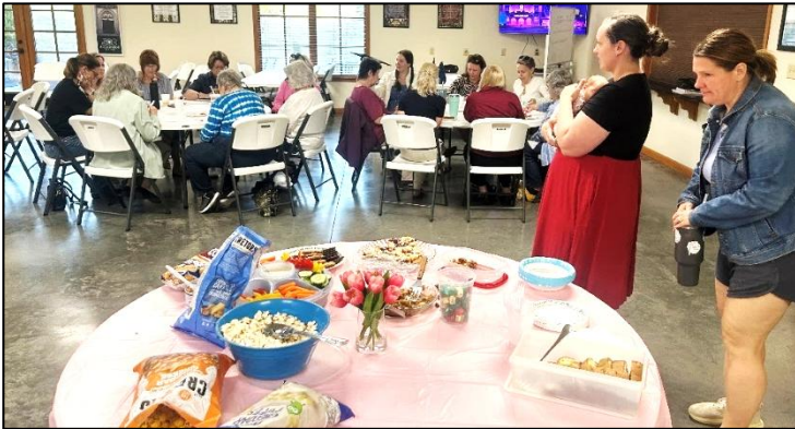
Katie's Sisters held Bingo night in March.