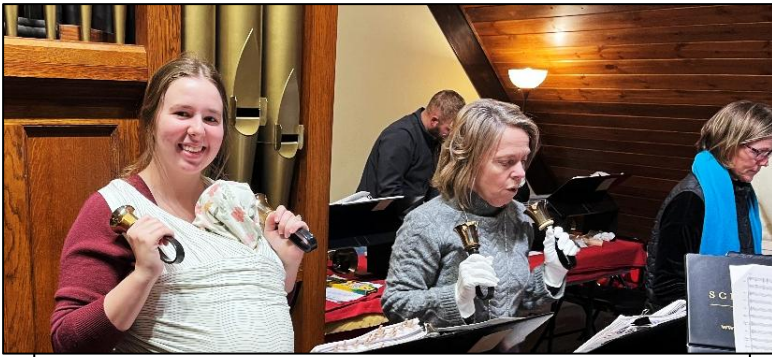
Our most gifted Bell Choir member and others.