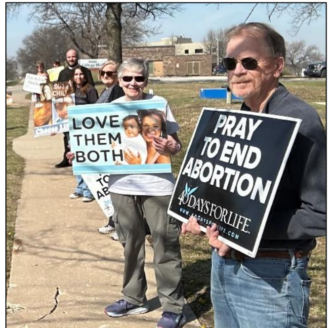
40 Days of Life Vigil. Thank you for all who came out this day.