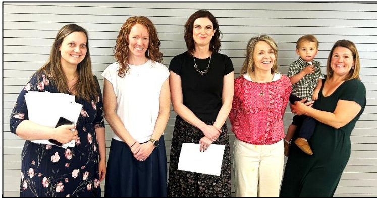
Playground Committee. They individually spent 40+ hours researching, meeting with vendors, site visits, and meetings to work a quality solution at the best possible price. They greatly offended Pastor Weinkauff because they would not let him pick out the playground colors.