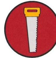
ST. JAMES THE LESSER According to tradition, St. James was stoned and sawn by his attackers.