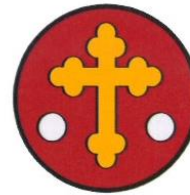
ST. PHILIP Jesus directed St. Philip to feed His people, represented here by two circles of bread.