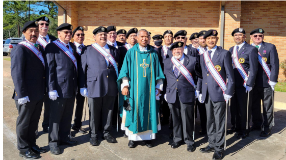
6403 Corporate Communion