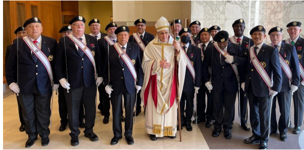
RESPECT LIFE MASS

A total of eighteen (18) SK's from the First District participated in the turn-out with Assembly #2084's 8 SK's representing 44.4% of the total attendance.