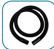
50-1008-A 15 ft. Vacuum Hose