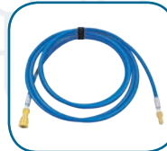
80-8007-A 15 ft. Solution Hose