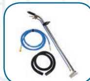
80-8009-A Hoses and Wand Kit