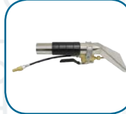
10-0501 4" S/S Upholstery Tool