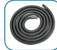
80-0503 25 ft. Vacuum Hose with Cuffs Assembly