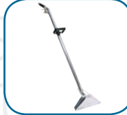
10-0861 12" S/S Dual Jet S-Bend Wand