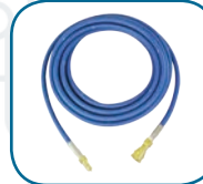
80-0502 25 ft. Solution Hose Assembly