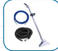
80-0500 Hoses and Wand Kit