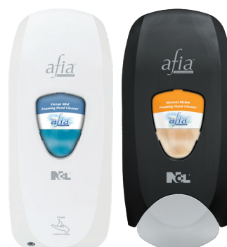
AFIA™ Foaming E2 Sanitizing Hand Cleaner (#0448)