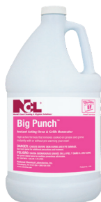
Big Punch™ (#1104)