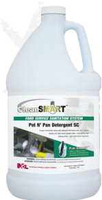
CleanSMART™ Pot N' Pan Detergent SC (#1115)

Chemicals and equipment for food service cleanliness.