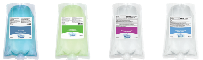
AFIA™ Ocean Mist (#0431)

Foaming hand soap is easy on the environment, affordable, efficient, and hygienic.