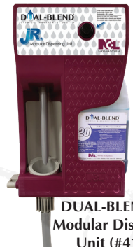
DUAL-BLEND JR. Modular Dispensing Unit (#4114)