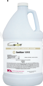
CleanSMART™ Sanitizer (#1116)