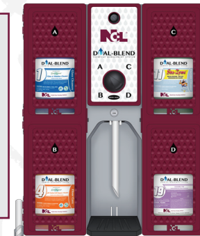
DUAL-BLEND Chemical Management System (#4113)

NOTE: Kill claims and dwell times determine the best types of disinfectants needed. CHOOSE ONE to keep in your Dual-Blend system.