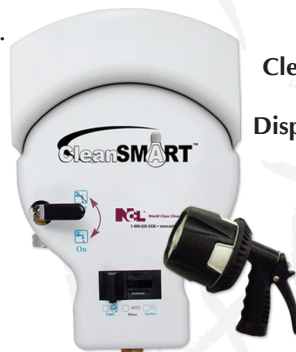
CleanSMART™ Foam Dispensing Unit (#4119)