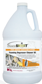
CleanSMART™ Foaming Degreaser Cleaner SC (#1117)