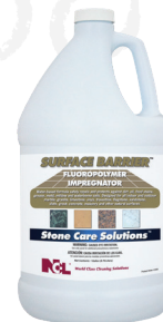
Surface Barrier™ (#2500)