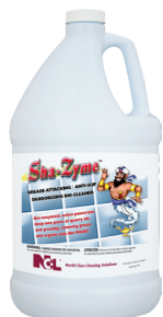
Sha-Zyme™ (#1830) CLASSIFIED UL

Effectively remove food soils from surfaces.