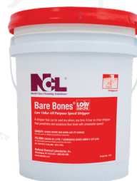
Bare Bones® Low Odor (#1051)