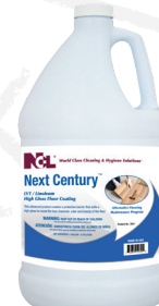
Next Century™ (#2623)