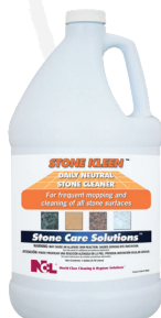
Stone Kleen™ (#2503)