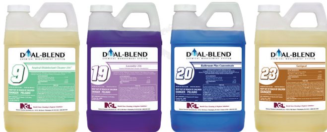
#9 Neutral Disinfectant Cleaner 256 (#5079)

No hassle dilution for disinfectant needs.