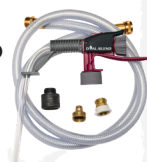
DUAL-BLEND Portable Dispensing Kit (#4166) Unit Only (#4165)