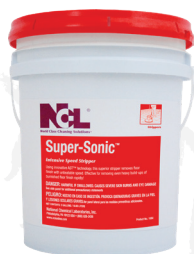
Super Sonic® (#1054)

Efficiently remove floor finish with ease.