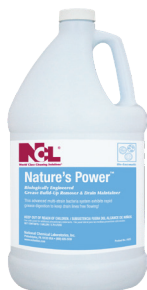
Action Unlimited Nature's Power™ (#1825)