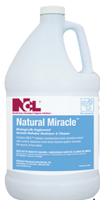
Natural Miracle™ (#1820)