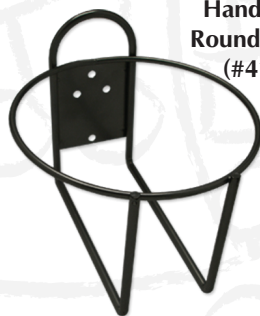
Handi Rack Round Gallon (#4145)