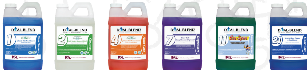
#1 ES Glass & Window Cleaner (#5071)

Tremendous value and precise dilution for maximum effectiveness.