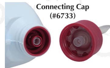
Pak-SMART™ Connecting Cap (#6733)