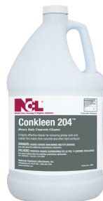
Conkleen 204™ (#0560)