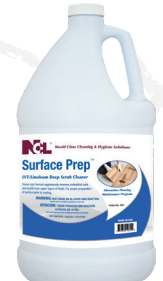
Surface Prep™ (#2621)