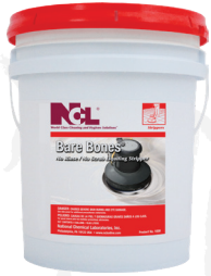
Bare Bones ® (#1058)

Efficiently remove floor finish with ease.