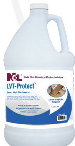
LVT-Protect ™ (#2622)