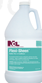
Flexi-Sheen ™ (#2612)