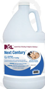
Next Century ™ (#2623)