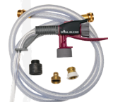
DUAL-BLEND Portable Dispensing Kit (#4166) Unit Only (#4165)