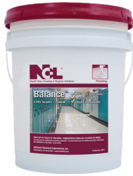
Balance ™ (#0573)