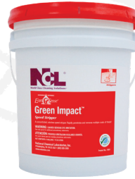
Green Impact (#1053)