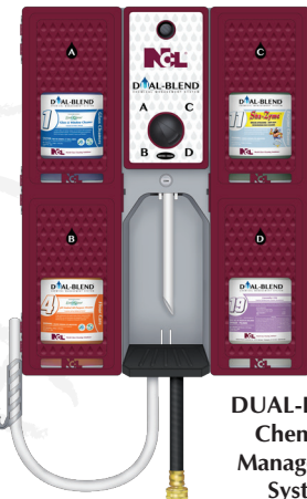
DUAL-BLEND Chemical Management System (#4113)