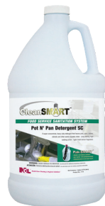
CleanSmart™ Pot & Pan Detergent SC (#1115)