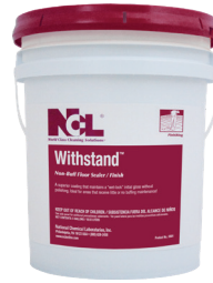
Withstand ™ (#0591)