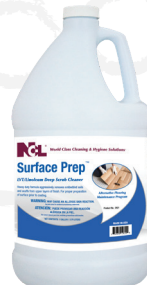
Surface Prep ™ (#2621)