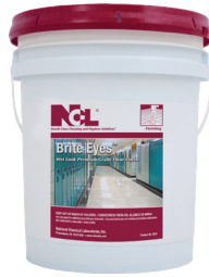
Brite Eyes ™ (#0521)