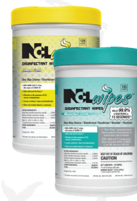
NCLwipes™ Disinfectant Wipes (#4542 & #4541)