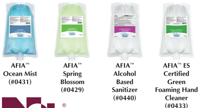
AFIA™ Ocean Mist (#0431)

Foaming hand soap is easy on the environment, affordable, efficient, and hygienic.