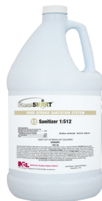
CleanSmart™ Sanitizer (#1116)