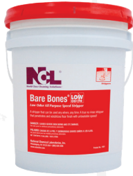
Bare Bones ® Low Odor (#1051)