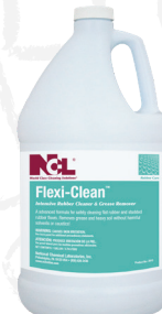
Flexi-Clean ™ (#2610)