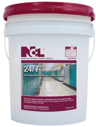
24/7 ® (#0593)

Designed to hold up to your unique hard floor traffic demands.