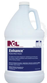
Enhance ™ (#0935)