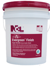
Evergreen ™ (#0508)