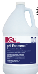
pH-Enomenal ™ (#0945)