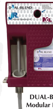
DUAL-BLEND JR. Modular Dispensing Unit (#4114)