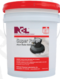
Super Purge (#1056)