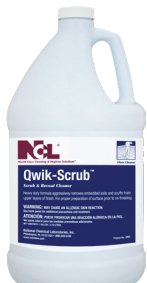
Qwik-Scrub ™ (#0955)