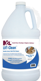
LVT-Clean ™ (#2620)

Floor care for the unique needs of LVT, Rubber and Linoleum.