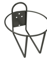
Handi Rack (#4145)