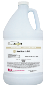
CleanSmart™ Sanitizer (#1116)