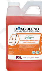
#4 ES pH Neutral All-Purpose Cleaner (#5074)