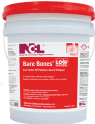
Bare Bones® Low Odor (#1051)