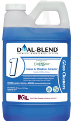
#1 ES Glass & Window Cleaner (#5071)

Utilize only Earth Sense products for a green dilution control program.