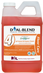
#4 ES pH Neutral All-Purpose Cleaner (#5074)

Tremendous value and precise dilution for maximum effectiveness.