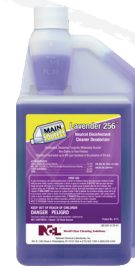
Main Squeeze™ Lavender 256™ (#4173)