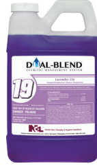
#19 Lavender 256 Neutral Disinfectant Cleaner Deodorizer (#5089)