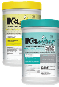
NCLwipes™ Disinfectant Wipes (#4542 & #4541)