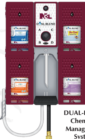
DUAL-BLEND Chemical Management System (#4113)