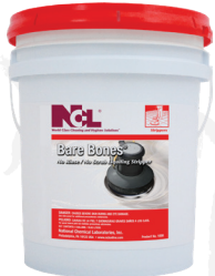
Bare Bones® (#1058)

Efficiently remove floor finish with ease.