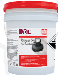
Super Purge™ (#1056)