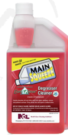
Main Squeeze™ ES Degreaser Cleaner (#4171)

System of portable dilution control products.