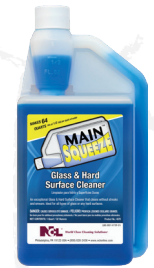
Main Squeeze™ Glass & Hard Surface Cleaner (#4170)