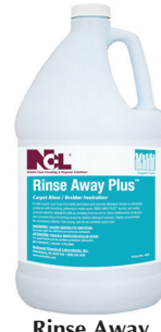
Rinse Away Plus™ (#0692)