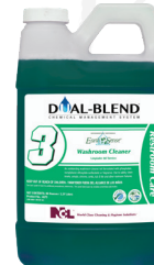
#3 ES Washroom Cleaner (#5073)