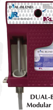
DUAL-BLEND JR. Modular Dispensing Unit (#4114)