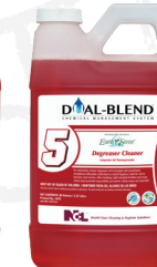
#5 ES Degreaser Cleaner (#5075)