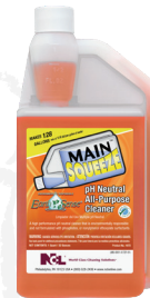
Main Squeeze™ ES pH Neutral All-Purpose Cleaner (#4172)