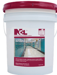
Brite Eyes™ (#0521)