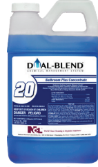
#20 Bathroom Plus Concentrate (#5090)