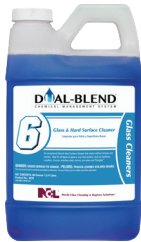
#6 Glass and Hard Surface Cleaner (#5076)