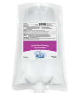
AFIA™ Alcohol Based Sanitizer (#0440)