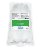
AFIA™ ES Certified Green Foaming Hand Cleaner (#0433)