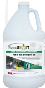
CleanSmart™ Pot & Pan Detergent SC (#1115)