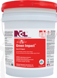
Green Impact™ (#1053)