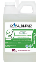
#2 ES Multi-Surface Cleaner with H 2 O 2 (#5072)