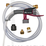
DUAL-BLEND Portable Dispensing Kit (#4166) Unit Only (#4165)