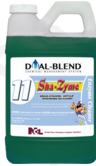
#11 Sha-Zyme Grease-Attacking/Anti-Slip/Deodorizing Bio-Cleaner (#5081)