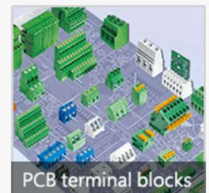
PCB terminal blocks