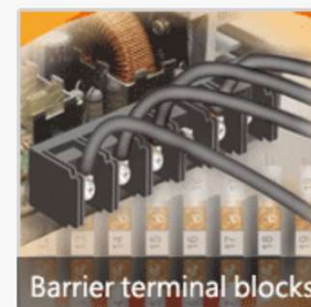
Barrier terminal blocks