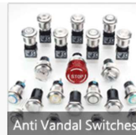
Anti Vandal Switches