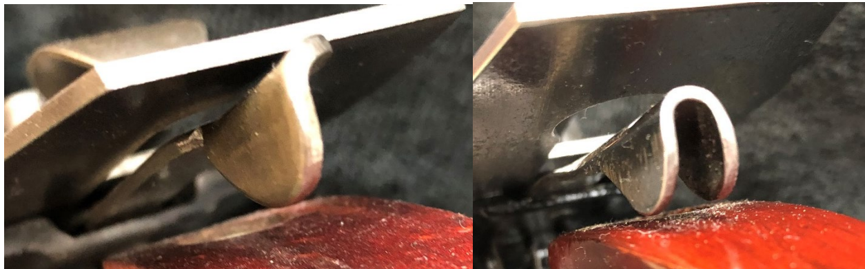
Figure 3 Millers Falls Tools left-hand bend lateral (left). Sargent & Company and Stanley Works inverted "U" lateral (right).

The first step in identifying a Craftsman hand plane Type is determining the manufacturer. The manufacturer can be determined mostly through cutter and lateral lever design. Millers Falls Tools manufactured bench planes are easy to identify by the distinctive left-hand bend lateral lever, while Sargent & Company bench planes and Stanley Works made Craftsman bench planes feature an inverted "U" bend lateral (figure 2).