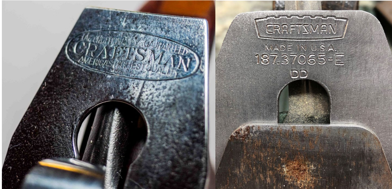
Figure 4 Sargent & Company keyhole up by trademark, left. Stanley Works keyhole down away from trademark with the 187-manufacturer code, right

However, Sargent & Company bench planes are always equipped with keyhole up cutters, while the Stanley Works made planes will always feature keyhole down cutters (figure 3). Additionally, by the time Stanley Works began supplying Craftsman bench planes, Sears, Roebuck and Co. had assigned a 3-digit manufacturers code of 187 to Stanley Works and it appears on the cutter near the trademark.