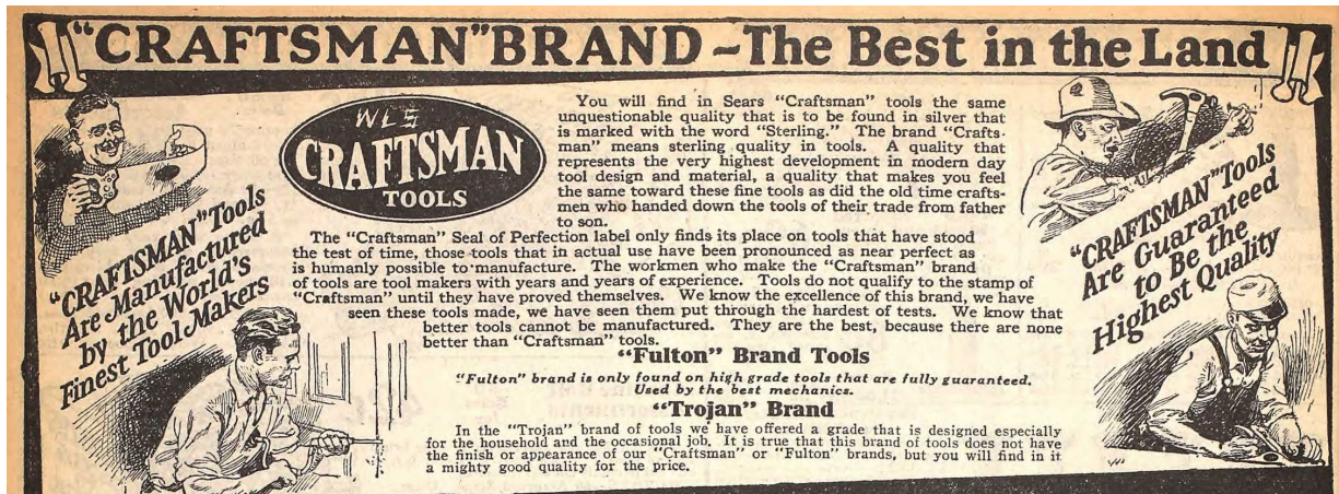
Figure 2 - 1928 Sears, Roebuck & Co. Spring/Summer catalog

The first step in identifying a Craftsman hand plane Type is determining the manufacturer. The manufacturer can be determined mostly through cutter and lateral lever design. Millers Falls Tools manufactured bench planes are easy to identify by the distinctive left-hand bend lateral lever, while Sargent & Company bench planes and Stanley Works made Craftsman bench planes feature an inverted "U" bend lateral (figure 2).