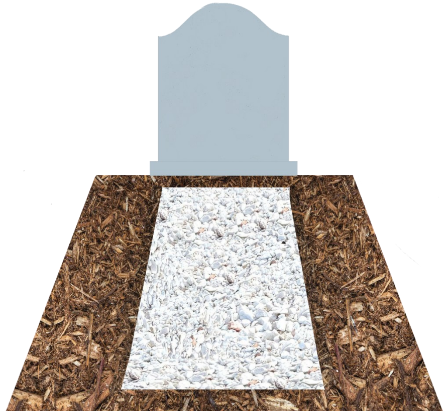
TWO SPACES WITH ROCK (same for 3 and 4 family plots) PLOT SIZE Remaining Gardens: Single Space: 4 ft wide x 10 ft 10 inches long