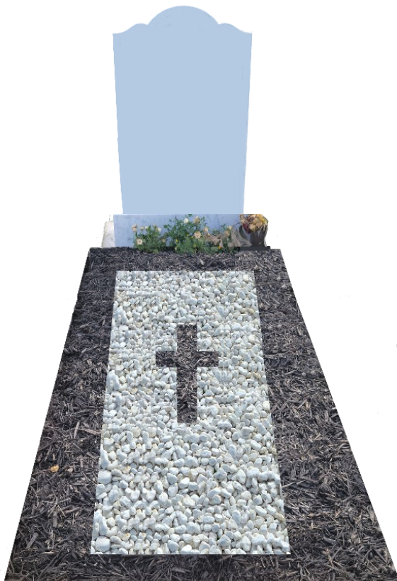
SINGLE SPACE WITH ROCK PLOT SIZE Marian Garden: Single Space: 3 ft 9 inches wide x 10 ft long

Acceptable rocks are natural, washed river rock or white rock. No black rocks, glass translucent florist gems or round marbles are allowed.