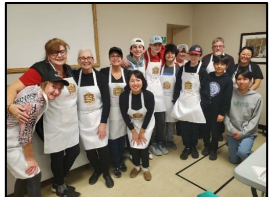
The Pancake Dinner crew!