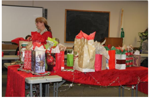
Dirty Santa Packages