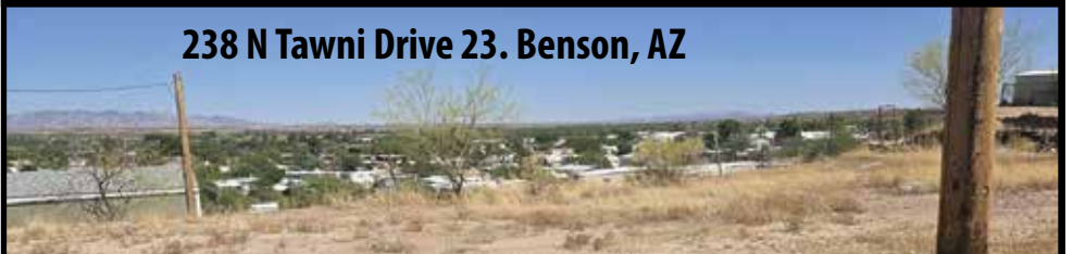
238 N Tawni Drive 23. Benson, AZ

Large fenced lot (.55 acre) with septic in place. Water and electric at lot line. Flat usable land with great views and close enough to I-10 for easy commute, but far from highway noise. Build or bring your dream home here.