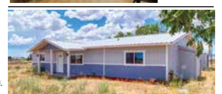
3080 W. Cox Rd., Willcox, AZ $315,000

Thriving local Sports Bar in a downtown historic building with fabulous granite bar top, original hard wood floors and ample stools for seating. 2000 SqFt.