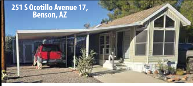
251 S Ocotillo Avenue 17, Benson, AZ

This beautiful home is waiting for next lucky homeowners! Spacious 3 bedroom, 2 bath home with vaulted Ceilings, fully equipped kitchen with panty, water softener and ceiling fans throughout. Gorgeous owner's Suite offers huge closet and luxurious bathroom with dual sinks, garden tub and separate shower. Great room, dining area with breakfast bar and nook with bench seating. Your outside oasis is complete with fire pit and gazebo with gorgeous views of the mountains. All this and a brand new AC 2024.