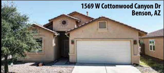
1569 W Cottonwood Canyon Dr Benson, AZ

This beautiful home is waiting for next lucky homeowners! Spacious 3 bedroom, 2 bath home with vaulted Ceilings, fully equipped kitchen with panty, water softener and ceiling fans throughout. Gorgeous owner's Suite offers huge closet and luxurious bathroom with dual sinks, garden tub and separate shower. Great room, dining area with breakfast bar and nook with bench seating. Your outside oasis is complete with fire pit and gazebo with gorgeous views of the mountains. All this and a brand new AC 2024.