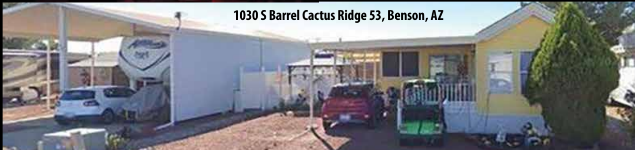
1030 S Barrel Cactus Ridge 53, Benson, AZ

Fully furnished two bedroom, one bath, well loved home in San Pedro RV Resort. Completely equipped wood shop (14' X 60') with lumber and multiple tools ready for all your projects. Resort includes pool, Spa, community center, Pickel Ball Court, dog park and much more! Move In Ready, so just hang up your clothes, stock the refrigerator, and get ready to enjoy the Good Life!!