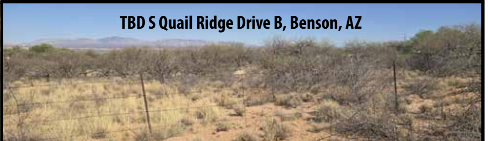
TBD S Quail Ridge Drive B, Benson, AZ

Almost an acre and a half (1.42AC) on corner lot in beautiful southeast Cochise County. Corner of Hwy 181 (paved) and Apache Drive. Close to the towns of Sunsites and Willcox and half hour to spectacular Cochise Stronghold. Flat usable land ready for your dream home, with FABULOUS MOUNTAIN VIEWS, dark skies, abundant wildlife and peace and serenity of country living. Drill a well, install a septic and build your dream home here.