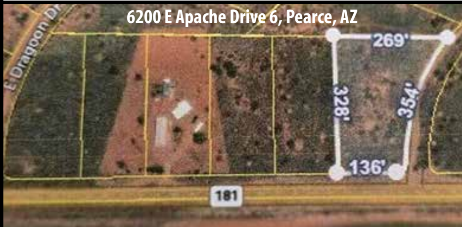
6200 E Apache Drive 6, Pearce, AZ

Fabulous views from this eight acre lot. Ready for your dream home. City utilities at street. Taxes are for 15.17 acres that include a residence. Treasurer will re access taxes upon recordation of split and new purchase.