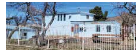
5348 S. Hwy 186 - $129,000

2 Bedroom 2 Bath, 1,752 SqFt. 0.37 acre. Muddy Mine's Building is located in the town of Dos Cabezas with beautiful views in every direction.