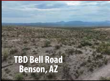
TBD Bell Road Benson, AZ

Looking for the peace and tranquility of a rural lifestyle? This 20 acres with multiple potential building sites, Including hilltop with SPECTACULAR VIEWS is it! Corner lot can be Off Grid, just drill a well and install septic. Beautiful Ocotillos and other desert flora and fauna. Can be purchased with adjoining 20 acre lot, see MLS #22525994.