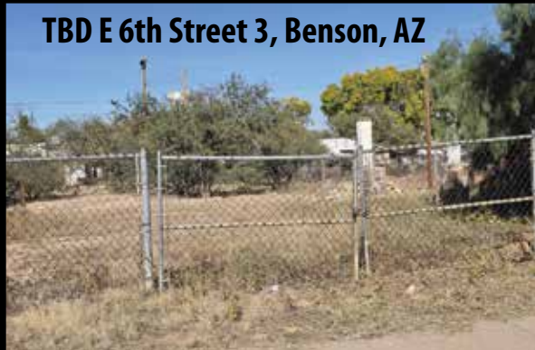
TBD E 6th Street 3, Benson, AZ

Fabulous views from this four acre lot. Ready for your dream home. City utilities at street. Taxes are for 15.17 acres that include a residence. Treasurer will re access taxes upon recordation of split and new purchase.