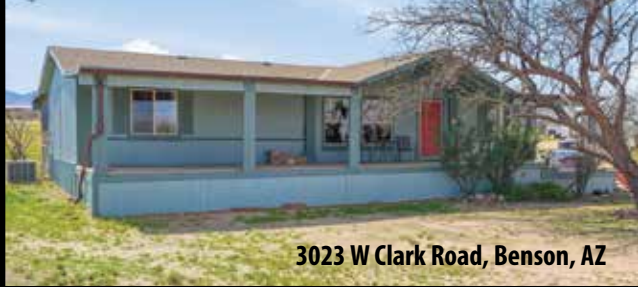
3023 W Clark Road, Benson, AZ