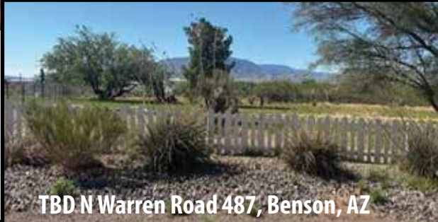
TBD N Warren Road 487, Benson, AZ

Convenient location, In-Town lot with all City Utilities available, ready for you to bring in, or build your Dream home. City of Benson sewer, gas and water at lot line. On paved street, close to schools, shopping, restaurants, etc.