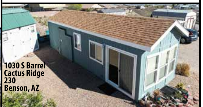
1030 S Barrel Cactus Ridge 230 Benson, AZ

Well loved Park Model with 14' X 16' Arizona Room, ready for next lucky homeowner. New Roof, new AC and new Water Heater July 2024, and kitchen appliances 3 years old. Cozy table top firepit in Gazebo. Plus washer and dryer in shed. In Gated RV Resort that offers heated Pool and Spa, community center, Laundry room, dog park and much more!