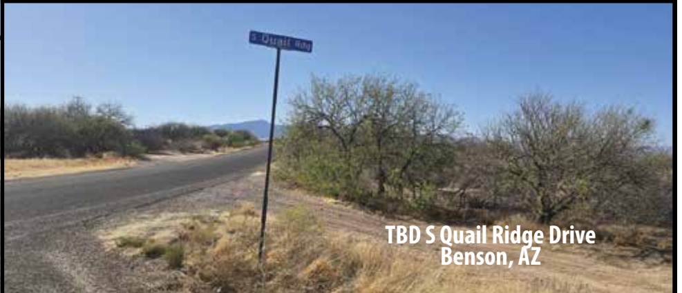
TBD S Quail Ridge Drive Benson, AZ

Looking for the peace and tranquility of a rural lifestyle? This 20 acres with multiple potential building sites, Including hilltop with SPECTACULAR VIEWS is it! Corner lot can be Off Grid, just drill a well and install septic. Beautiful Ocotillos and other desert flora and fauna. Can be purchased with adjoining 20 acre lot, see MLS #22525994.