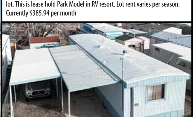
1110 S Arizona 80 24, Benson, AZ

Gorgeous home with fabulous hilltop views! 3 BDRM/2BA with charming wood fireplace in Living room/Guest room. Stainless steel appliances in well equipped kitchen. Stunning ceramic tile counter tops in kitchen, bathrooms and shower/tub surrounds. Covered back patio w/ decorative metal fencing, rock landscaping for easy care and entire acre has 6' chain link fencing. Oversized 2 car garage & shed.