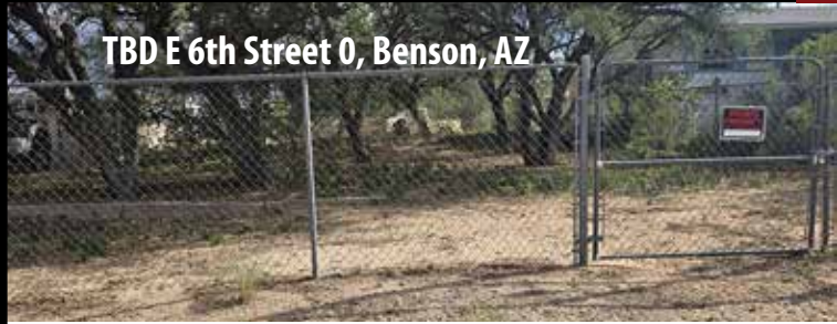
TBD E 6th Street 0, Benson, AZ