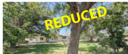
234 S. Quail Dr., Willcox, AZ - $166,250

Spacious bedroom with a walk-in closet and a bathroom equipped with a beautifully tiled walk-in shower. Enjoy breathtaking views of the Dagoon and Texas Canyon Mountains from the covered porches at both the front and back of the house. The expansive living room flows into a well-designed kitchen that includes a center island, abundant cabinetry, stainless steel appliances, and elegant tile countertops, two-car garage with an attached two-car carport and durable metal roofing throughout. Personal furnishings, an upright freezer, and a John Deere riding lawnmower are negotiable, offering added flexibility for prospective buyers.