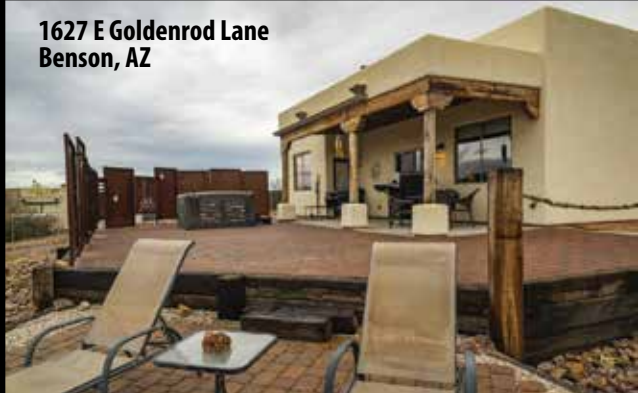
1627 E Goldenrod Lane Benson, AZ

Absolutely Adorable! This immaculate one bedroom, one bath Park Model includes, a screened in porch and shed with washer and dryer, plus covered parking, and low care Landscaped yard. Community offers Clubhouse with fitness room, laundry room, pool table, TV area, party area, AND Pool, Spa and small observatory. Pickleball court and dog park, too. All this and more! Conveniently located close to shopping, medical services, restaurants, library, etc. Partially furnished, and furniture negotiable by separate Bill of Sale. Price is for home, and lot rent is $385.94 per month and adjusts seasonally. Buyer must apply to Butterfield RV Resort to rent lot. This is lease hold Park Model in RV resort. Lot rent varies per season. Currently $385.94 per month