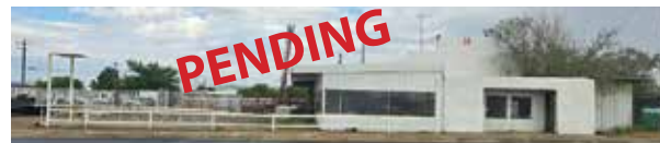
440 N Haskell Avenue, Willcox, AZ - $165,000

This unique 3+ bedroom, 2.5 bath rambler offers potential for the right buyer. All bedrooms feature new flooring, and the home has been updated with grounded GFCI outlets throughout. An in-ground swimming pool housed in a connected building is ready for renovation. This structure was once as a spacious recreational area with 2 sets of sliding glass doors separating the pool from a former bar and entertainment space. While the building needs a new roof and repairs, the potential for a fantastic indoor/outdoor retreat is clear. Situated on approximately 11 acres of land, the property boasts mature mulberry, mesquite, apple, quince, and honey locust trees, providing, fruit, and beauty. Bordering a pistachio/pecan orchard, the land attracts a variety of birds and wildlife including deer, javelinas, desert tortoises, & horned toads.