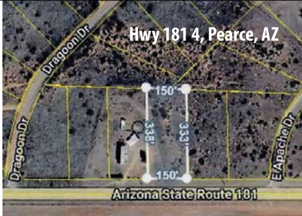
Hwy 181 4, Pearce, AZ

One Plus acre in beautiful South East Cochise County on Hwy 181, just half hour to Spectacular Cochise Stronghold. Flat, usable land, ready for our dream home, with Fabulous Mountain views and close to the towns of Sunsites and Willcox. Enjoy the peace and serenity of Country living at it's finest, with abundant wildlife and dark skies.