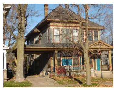
21. Theodore P. Heinemann Residence, 929 Central Ave. (West side of Central Ave. at 10<sup>th</sup> St.), Carpenter-Builder style home built around 1890. T.P. was a talented artist and painter. He was a member of an early barn advertising painting crew that included James Whitcomb Riley. He also papered rooms adding artistic borders and edges. In 1888 T.P. began manufacturing his "Triple Sign". It was a sign that told three different messages depending of the vantage-point of the viewer.