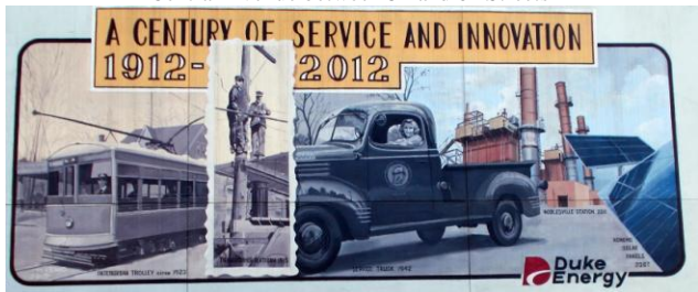
Central Avenue between 6<sup>th</sup> and 7<sup>th</sup> Streets