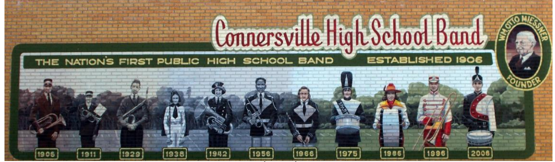
Central Avenue between 5th and 6th Streets