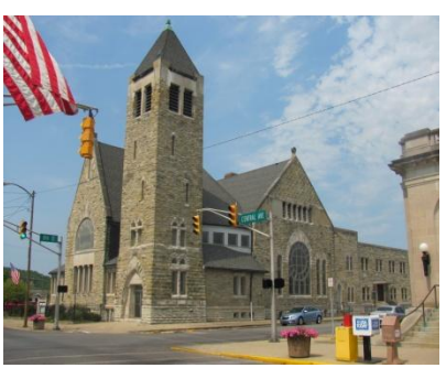
17. First Methodist Church, 729 Central Ave. (Southwest corner of 8<sup>th</sup> St. & Central Ave.), Romanesque revival style church built in 1889. A large addition to the church on the West side was constructed in 1956.