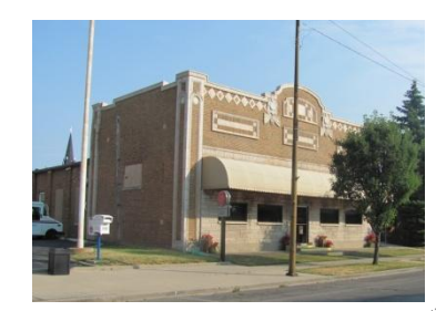
20. Inland Motors Building, 815 Central Ave. (West side of Central Ave. between 8<sup>th</sup> & 9<sup>th</sup> Streets), Art Moderne style structure built in 1916. For ten years, the Inland Motors building was the place you bought your Connersville built Lexington car. The building has always been owned by the Tatman family, publishers of the Connersville News Examiner. It was also a Western Auto Store, a B.F Goodrich tire store and since 1975 is has been the home of Commercial Printing Services.