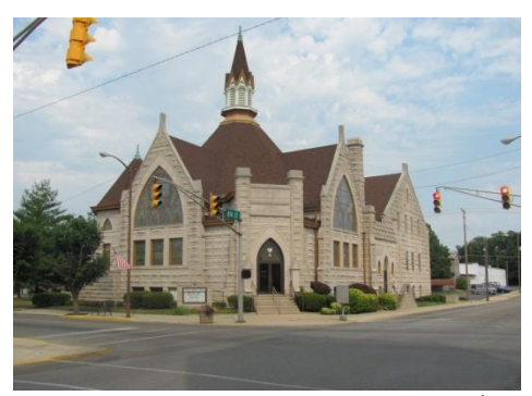
18. Central Christian Church, 800 Central Ave. (Northeast corner of 8<sup>th</sup> St. & Central Ave.), Late Gothic revival style church built in 1904. Built on land purchased from the Conwell family just after the turn of the 20<sup>th</sup> century.