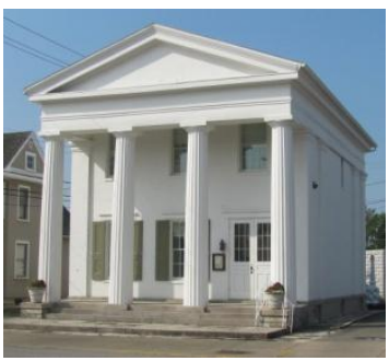
1. Canal House, 111 E. 4<sup>th</sup> St. (South side of 4<sup>th</sup> St. between Central & Eastern Avenues). Greek revival structure built in 1842. The Canal House is one of the best examples of classic Greek revival architecture in the state of Indiana. Included in the National Register of Historic Places. it was headquarters of the Whitewater Canal Company from 1842 to 1854 and the Savings Bank of Indiana in 1855. It then became the residence of Dr. S.W. Vance and, later, Congressman Finley Gray. It is currently owned by Historic Connersville, Incorporated.