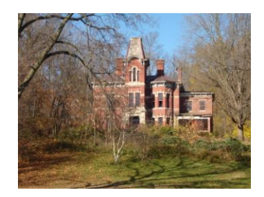
43. William Newkirk Residence, 319 Western Ave. (West side of Western Ave. at 4<sup>th</sup> Street). Second Empire Italianate design home built in 1880-82. William Newkirk was President of the Indiana Furniture Company. Newkirk had his employees install massive baseboards and crown moldings in the house as well as hand carved fireplace mantles. The home also includes a wooden spiral staircase from the second floor into the tower.