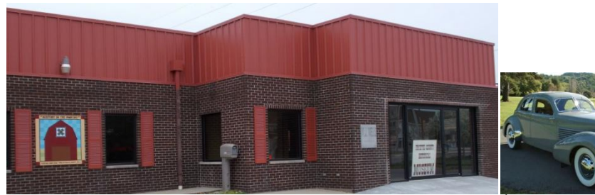
Fayette County Historical Museum 200 West 5<sup>th</sup> Street Owned and Operated by Historic Connersville, Inc.

Native American artifacts, pioneer life, and Fayette County manufacturing history, featuring Connersville built horse drawn vehicles and automobiles. The museum is open to the public and supported through dues and donation. 765.825.0946