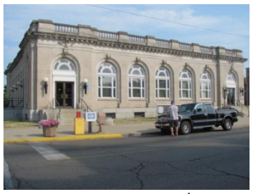
19. Connersville Post Office Building, 801 Central Ave. (Northwest corner of 8<sup>th</sup> St. & Central Ave.), Neo Classic style government building built in 1910. Earlier Post Offices were located at 408 Central Ave. and two locations near 5<sup>th</sup> St. and Eastern Ave.