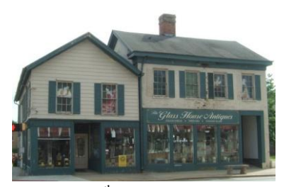
4. The Glass House Building, 135 E. 5<sup>th</sup> St. (Southwest corner of 5<sup>th</sup> St. & Eastern Ave.) It is a commercial log structure built by John Conner in 1815. It is the oldest surviving building in Connersville. The building was used as a store, trading post, post office, the George Heinemann grocery and a variety of other businesses.