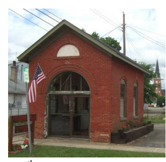
38. First Ward Hose House. (Intersection of Washington St. & 7<sup>th</sup> St.), Romanesque revival structure built in 1870. The last of a series of hose houses located in two "wards" in Connersville. In the era of horse drawn fire equipment, hose houses stored hoses and other fire equipment too heavy to be pulled to a neighborhood fire by horses. Motorized fire trucks later eliminated the need for hose houses. This site is maintained by Historic Connersville, Incorporated.