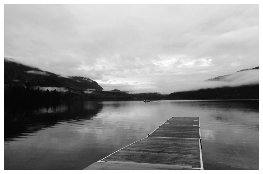
Figure 4. Cultus Lake from its north shore. Photograph courtesy Whitney Bajric, December 2013.

Chilliwack District," he wrote, "have cut a good horse trail 'free Gratis' to the mountain meadows. The trail goes up the crest of the Mountain with switchbacks, and in places where they have cut a look out a person has a beautiful view of country to the north, west and east." The trails that residents had carved into the land, according to him, differed from those made by loggers, cattle drovers, and railway companies. Jeff Oliver's work suggests that colonial stories about place are not always and only at odds with Indigenous stories; rather, they are multi-layered and often at odds with one another. McCullough's trail story distinguishes a certain kind of non-Indigenous lake-user from others. Rather than opening the land to resource extraction, the paths they had built led respectful visitors to admire the area's scenic beauty. They would help people appreciate the lake environment as "one of the most beautiful and accessible playgrounds on the Pacific coast," as a Cultus Lake Park Board chairman described it in 1931.