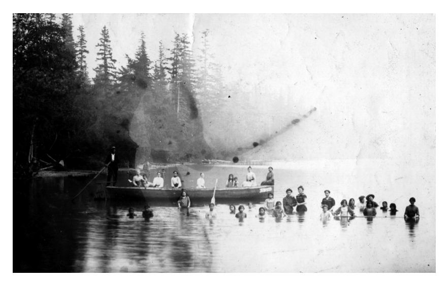
Figure 1. Group at Cultus Lake.

to them. Some of the teachers appear delighted; smiles are visible on their faces. Most of them sit in the large canoe, and four stand in the waters with the children.