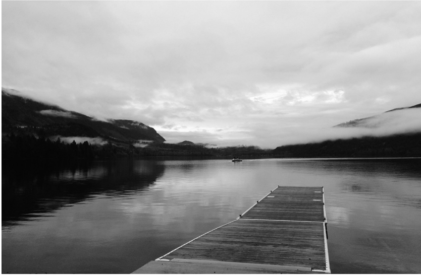
Figure 4. Cultus Lake from its north shore. Photograph courtesy Whitney Bajric, December 2013.

Chilliwack District,” he wrote, “have cut a good horse trail ‘free Gratis’ to the mountain meadows. The trail goes up the crest of the Mountain with switchbacks, and in places where they have cut a look out a person has a beautiful view of country to the north, west and east.” 72 The trails that residents had carved into the land, according to him, differed from those made by loggers, cattle drovers, and railway companies. Jeff Oliver’s work suggests that colonial stories about place are not always and only at odds with Indigenous stories; rather, they are multi-layered and often at odds with one another. 73 McCullough’s trail story distinguishes a certain kind of non-Indigenous lake-user from others. Rather than opening the land to resource extraction, the paths they had built led respectful visitors to admire the area’s scenic beauty. They would help people appreciate the lake environment as “one of the most beautiful and accessible playgrounds on the Pacific coast,” as a Cultus Lake Park Board chairman described it in 1931. 74