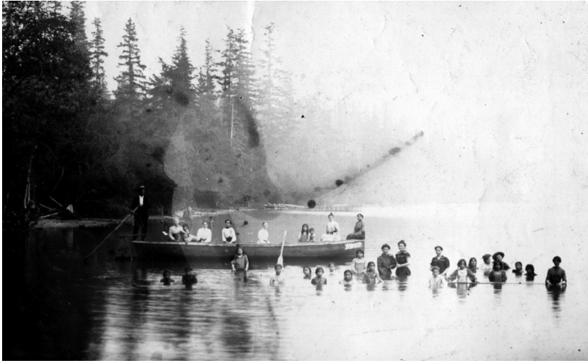
Figure 1. Group at Cultus Lake. Photo courtesy of the Chilliwack Museum and Archives, P5758, J.O. Booen, 1896.

to them. Some of the teachers appear delighted; smiles are visible on their faces. Most of them sit in the large canoe, and four stand in the waters with the children.