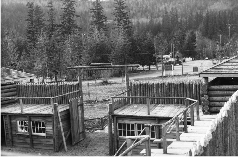
Figure 3. Frontier town built at Cultus Lake.