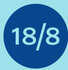
18/8 Stainless Steel