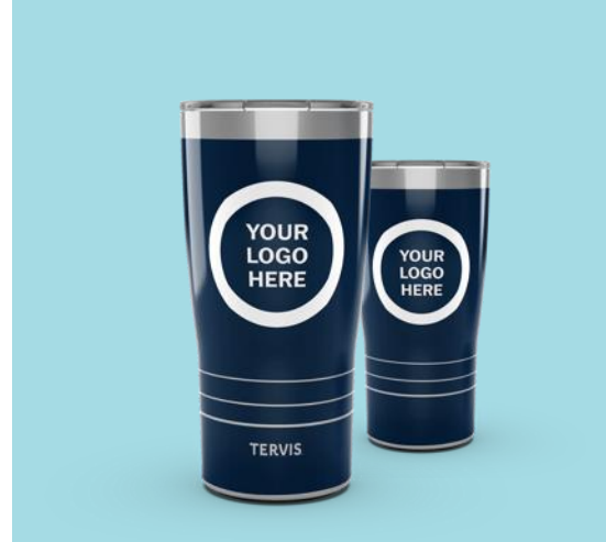
Dual Logo Placement