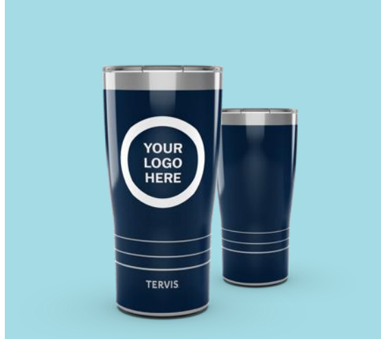
Single Logo Placement