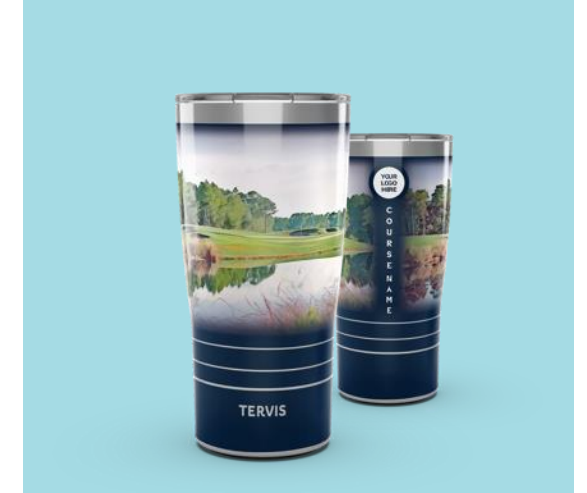
Photo Placement with Logo