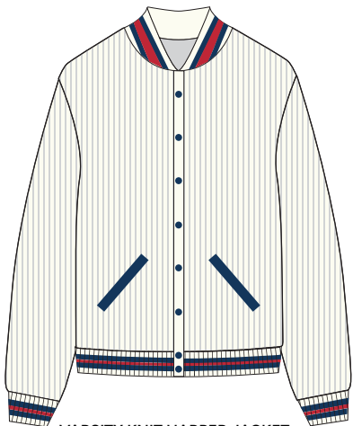
VARSITY KNIT HARPER JACKET EIV-VJAMERW 100% Cotton Relaxed Fit Welt Collar Falls Below Hips Snap Buttons XS - XL Ivory with Red & Navy