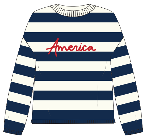
STRIPED AMERICAN SADIE CREWNECK EIV-SSTAMERWN 60% Cotton / 30% Nylon / 10% Wool Knit Application - Acrylic Chainstitch Drop Shoulder Open Hem & Sleeve Opening Relaxed Fit XS - XL Navy with Ivory