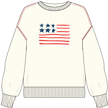
AMERICAN FLAG RILEY CREWNECK

EIV-WOSCHNFLGW 100% Cotton Oversized Fit Drop Shoulder Contrast Stitching Wide Neckline Knit Application - Chenille XS - XL Ivory