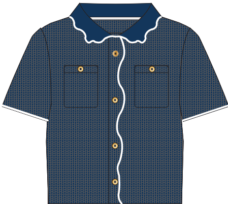
CROCHET LYLA BUTTON UP

EIV-RAMERWN 100% Cotton Oversized Vented Hem Hidden Placket XS - XL Ivory with Red & Navy