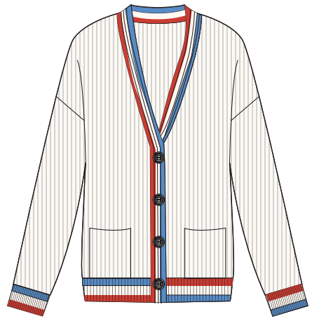
AMERICANA BILLY CARDIGAN EIV-BCAMERICAW 45% Cotton / 55% Acrylic Drop Shoulder Double Patch Pockets Boyfriend Fit Layering Garment XS - XL Navy with Ivory