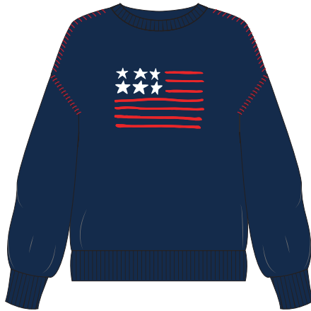
AMERICAN FLAG RILEY CREWNECK

EIV-WOSCHNFLGW 100% Cotton Oversized Fit Drop Shoulder Contrast Stitching Wide Neckline Knit Application - Chenille XS - XL Ivory