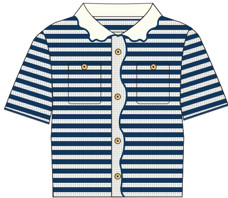
CROCHET LYLA BUTTON UP

EIV-HSAMERN 100% Cotton Layering Garment Double Pocket Front Scallop Detail XS - XL Navy with Ivory