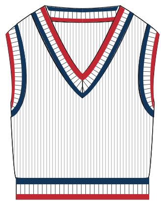
ELLIE KNIT VEST EIV-SVAMERW 45% Cotton / 55% Acrylic Relaxed Fit V-Neck Falls at the Hip XS - XL Ivory with Red & Navy