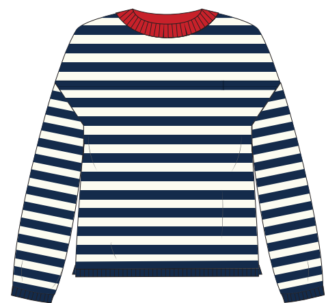
STRIPED SADIE CREWNECK EIV-SSTCONAMN 60% Cotton / 30% Nylon / 10% Wool Drop Shoulder Open Hem & Sleeve Opening Relaxed Fit XS - XL Navy with Ivory & Red