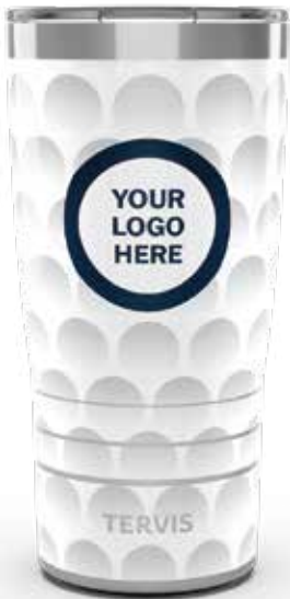
Golf Ball Texture