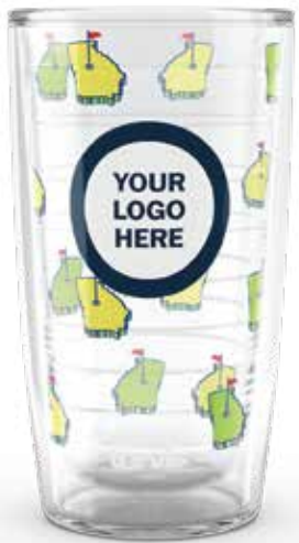
State Of Mind Multiple States available