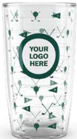
Matter of Course