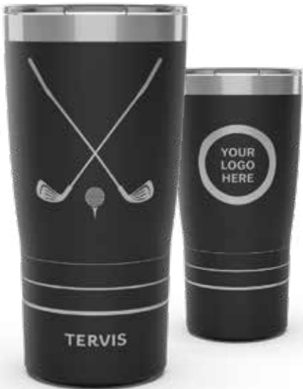
A Golfer's Life