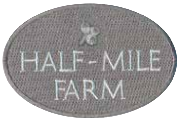
Partial Dye Sublimation with Embroidery