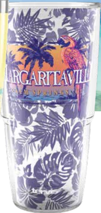
Mauve a Rita