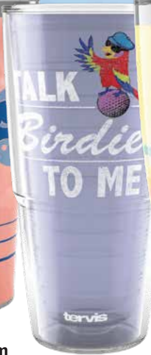
Talk Birdie To Me