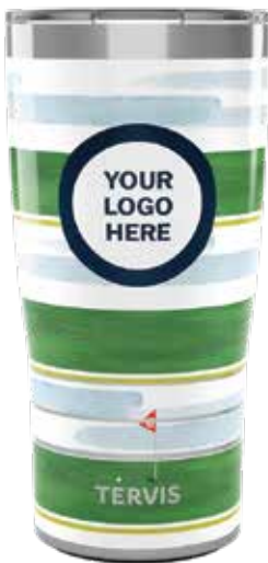
Sink The Putt