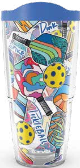
Spike Dink Ace