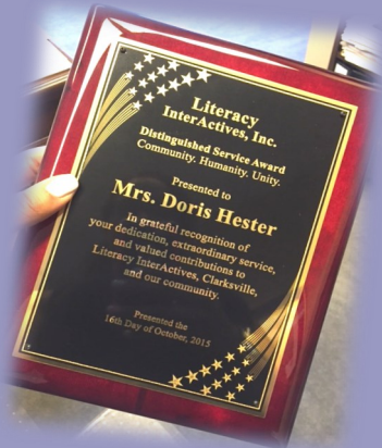
LIA Distinguished Service Award Community Humanity Unity