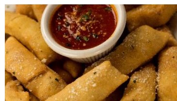
Rosati's Style Breadsticks