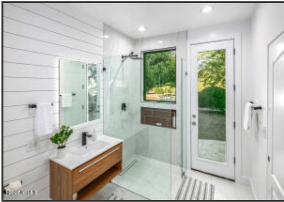
A Guest Bath