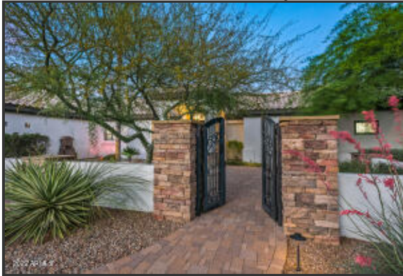
A Front Court Yard Entry