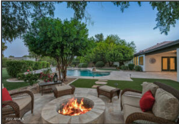
A Fireplace Patio