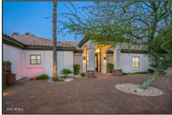
A Front Views