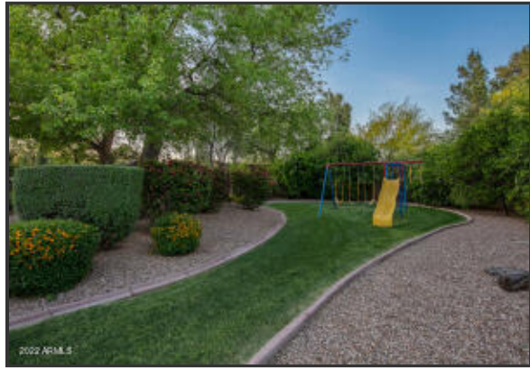
A SWINGSET BackYards