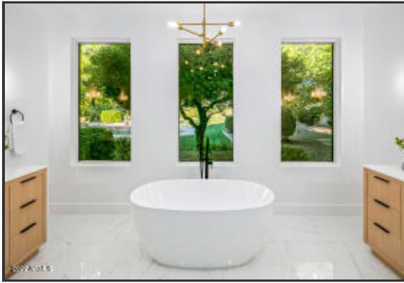
A Master Bath Details