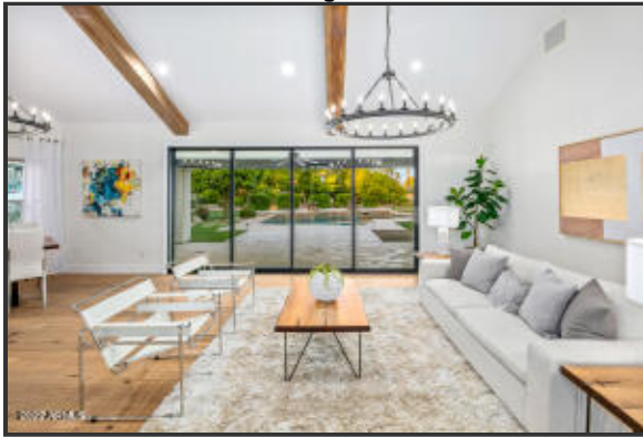
A Living Room