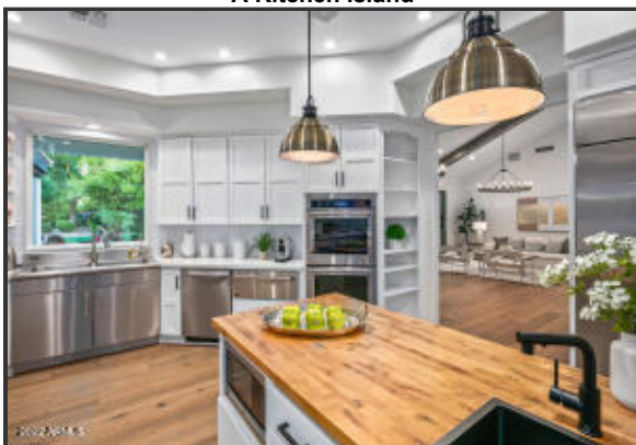
A Kitchen Island