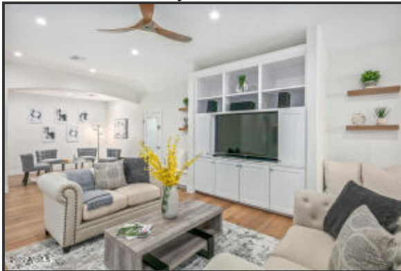
A Family Room Details