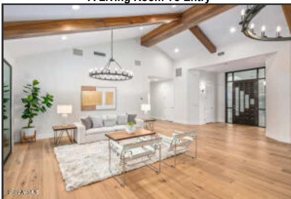
A Living Room To Entry