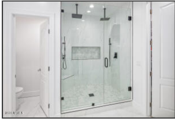
A Master Shower