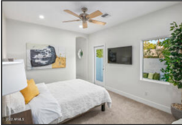
A Guest Suite