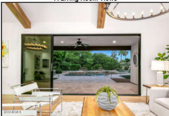
A Living Room Views