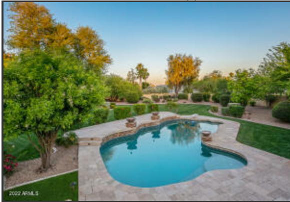
A Poolside Views(1)