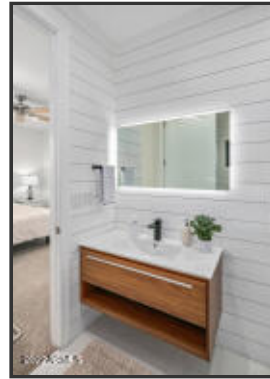
A Ensuite Bath Details