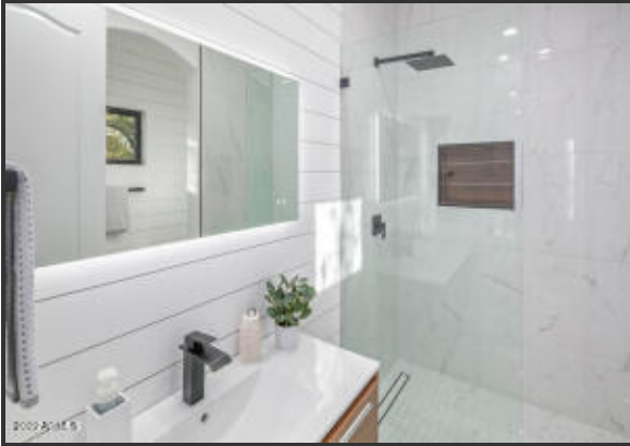
A Ensuite Bath