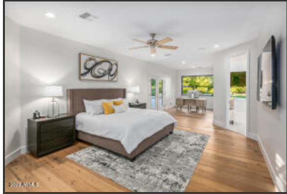
A Master Bedroom Ensuite