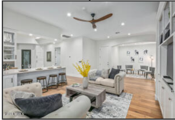
A Family Room