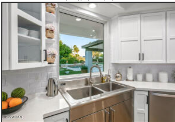
a Kitchen Views