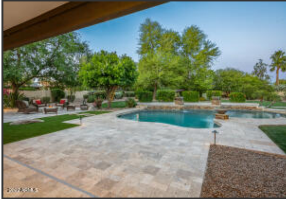
A Outdoor Living