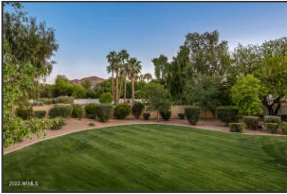
A Back Yards ~ Mountain Views