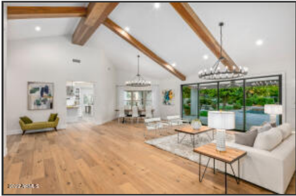
A Great Room