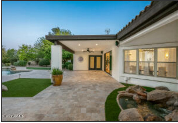
A Back Patios