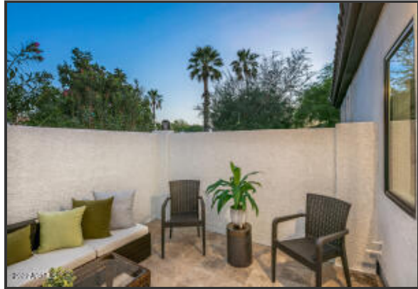
A Guest Suite Patios