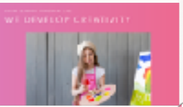
We develop Creativity