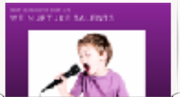
We nurture Talents