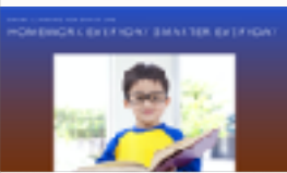
Homework Everyday, Smarter Everyday