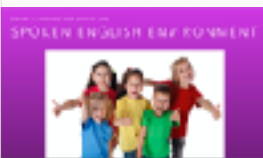
Spoken English Environment