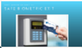
Safe Biometric Exit