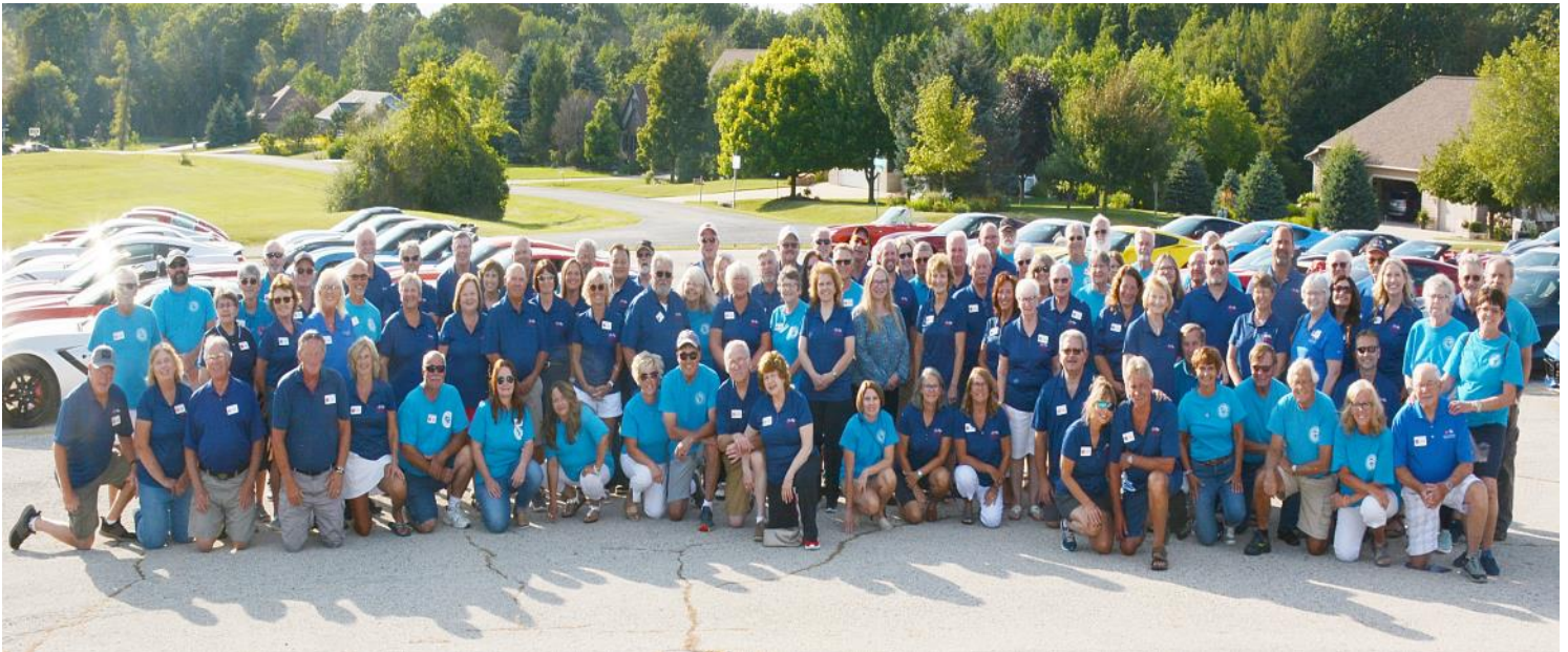
KMCC CLUB PICTURE, AUGUST 7TH, 2024