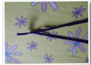
Ribbon with knotted end

Ribbons should be cut at 44". (The video says 48," but 44" works fine.) Bring the ends together and tie a knot to form a large loop.