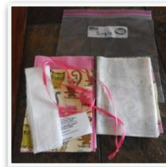
Kit components ready for sewing

Tie – 2" wide X 66-69" long Ribbon – 44" long tied short distance from the raw ends to form a loop