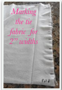
Marking the tie fabric for 2" widths