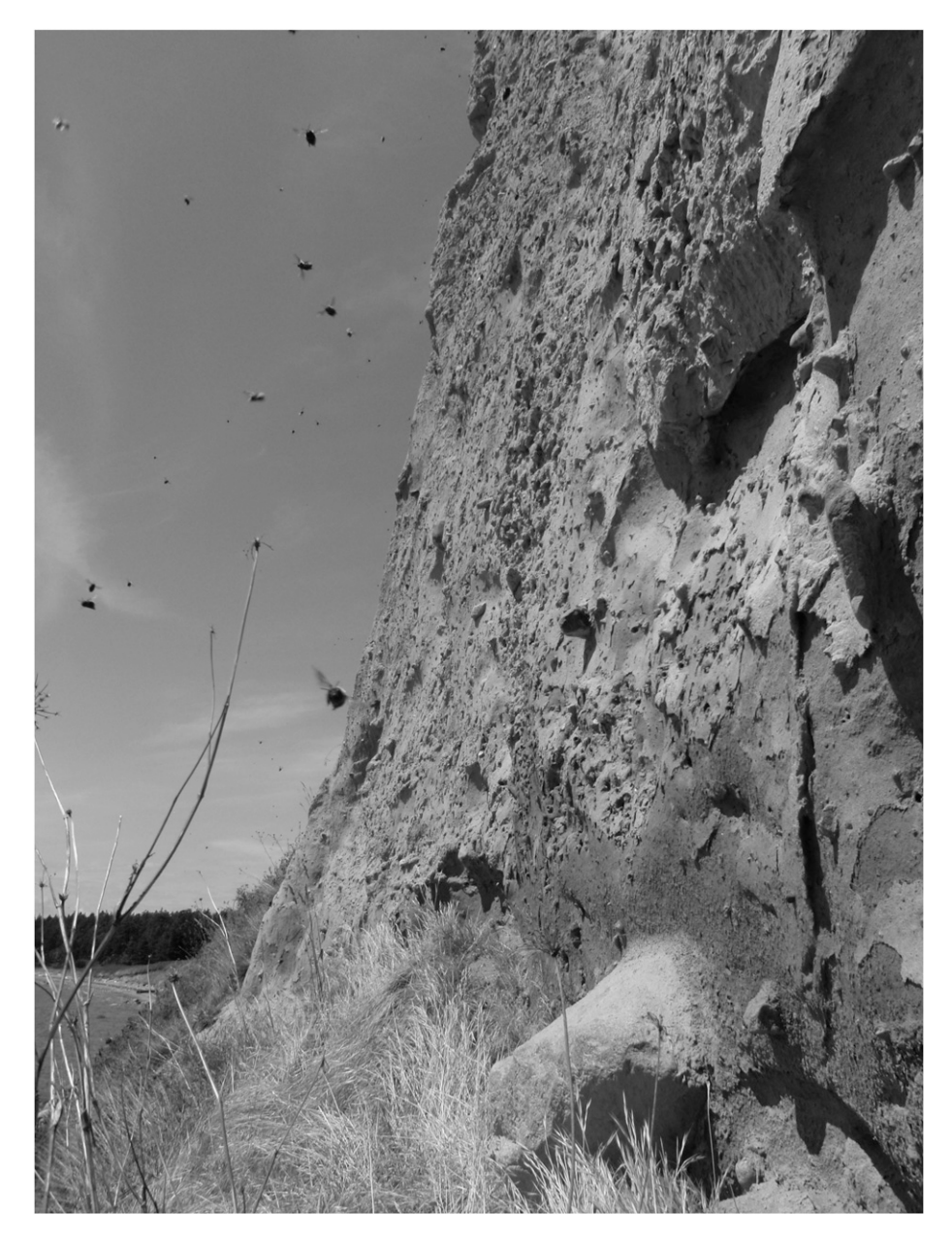
Figure 3. View of bee activity in a dense area of an Anthophora (Melea) bomboides aggregation, where nest concentrations of up to 630/m2 were observed. (Photo: T. Hanson, Cowlitz Bay Preserve, Waldron Island, Washington, 2015).

(Stone 1994). An unpublished report of 180,000 nests for A. edwardsii has been noted elsewhere (Cane 2008), however, suggesting that digger bee aggregations of multiple Anthophora subgenera have the potential to become very large. Nest sites of similar magnitude have also been described for other wild solitary bees, including 155,000 for the prairie nomia, Dieunomia (Epinoma) triangulifera (Vachal, 1897) (Halictidae)