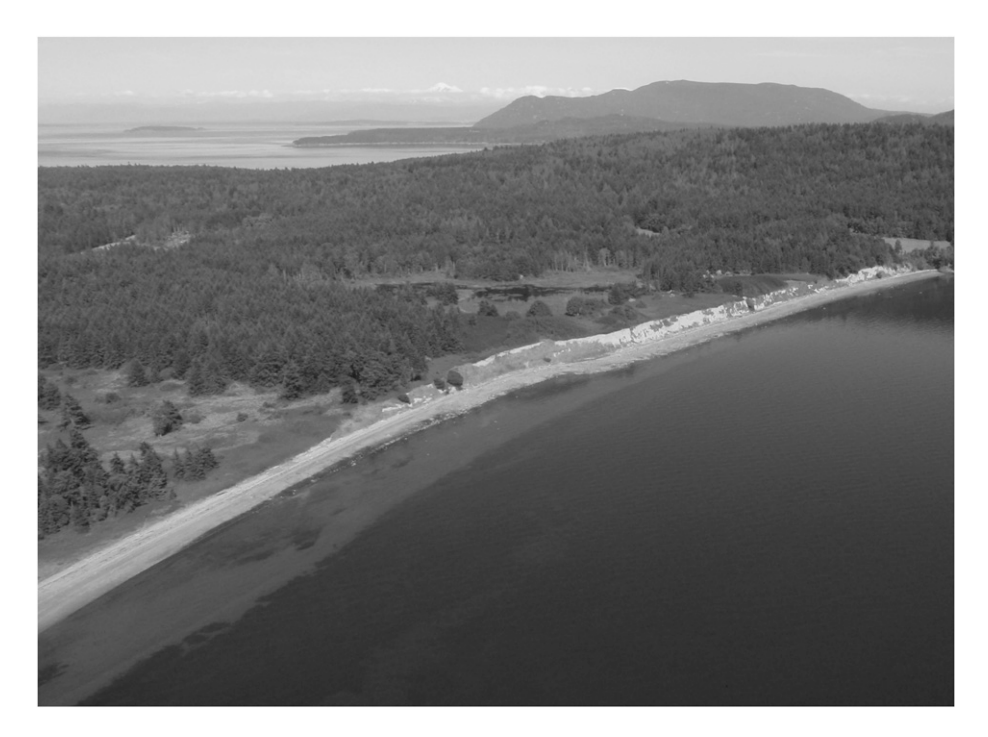
Figure 2. Aerial view of the Cowlitz Bay Preserve on Waldron Island, Washington, showing a complete habitat for Anthophora – the sandy bluff for nesting (above beach), wetlands for fresh water (center), and extensive floral resources in the regenerating pastures (center, above beach and bluff). Encroaching coniferous forest is also visible surrounding the wetland and shrub thickets. (Photo: T. Hanson, Cowlitz Bay Preserve, Waldron Island, Washington, 2017.)

Study Site. The Cowlitz Bay Preserve ("the site") is a natural area on Waldron Island, Washington, owned and managed by the San Juan Preservation Trust, a local nonprofit organization. The site includes 109 ha of coniferous forest, wetlands, and regenerating farmland on the southwestern shoreline of the island (Fig. 2). It provides a "complete habitat" (Westrich 1996) for Anthophora , offering nesting substrate in close proximity to floral resources and a source of fresh water used in nest construction (Brooks 1983). The land rises steeply from the beach in a bluff comprised of sand, small cobbles, and other marine sorted glacial outwash. The bluff measures 1.0 km in length, with a mean height of 9.3 m. Anthophora bomboides nest across the surface of this bluff, forming exceptionally dense aggregations in places. Floral resources occur