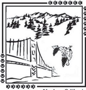
Northern California Working Group Association Inc