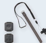
Medical & panic transmitters