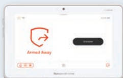
7" Touchscreen Display (Wireless)