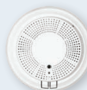
Combination smoke/CO detector