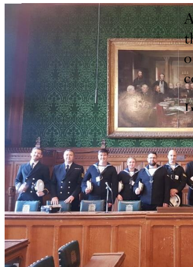
Members of Ships company in Parliament alongside Lady

In the evening, Ships Company and valued guests were treated to an evening reception at the Historic Dockyard Chatham, celebrating Chatham's deep naval roots with a 3 course dinner and some questionable dance moves.