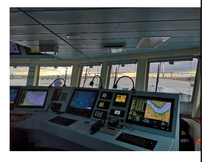
Bridge during the River Thames transit.

Successful completion of OST means Medway has proven herself as a capable and ever developing platform that is now at the forefront of the UK's foreign policy, ready to serve the Royal Navy's and the United Kingdom's interests overseas and in home waters.