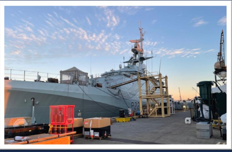
HMS MEDWAY alongside in the BAE Jacksonville Shipyard.