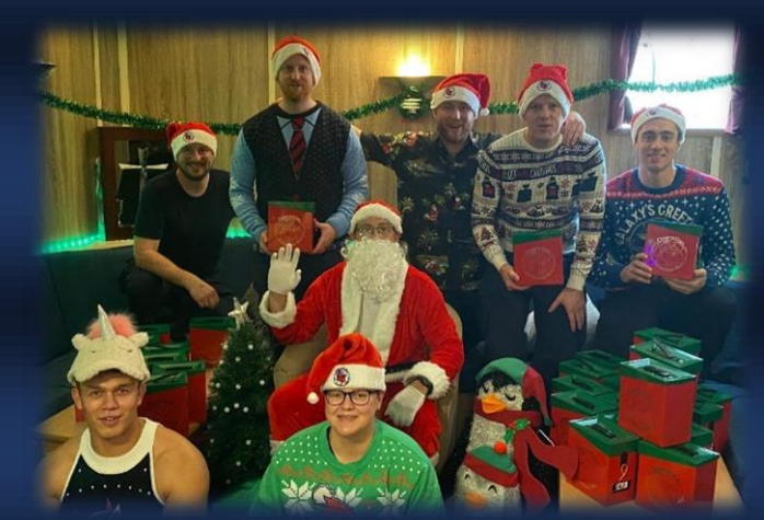
An early visit from Santa Claus saw Ship's Company open Operational Christmas Boxes in the Wardroom.

The Royal Navy Adventure Training team flew out to provide a challenging yet highly enjoyable AT package; this included mountain biking, stand-up paddle boarding and hiking! On top of this, personnel from MEDWAY have attended a wide variety of sporting events; including ice hockey, supporting the Jacksonville Icemen and NFL action witnessing the Jacksonville Jaguars play the Houston Texans.