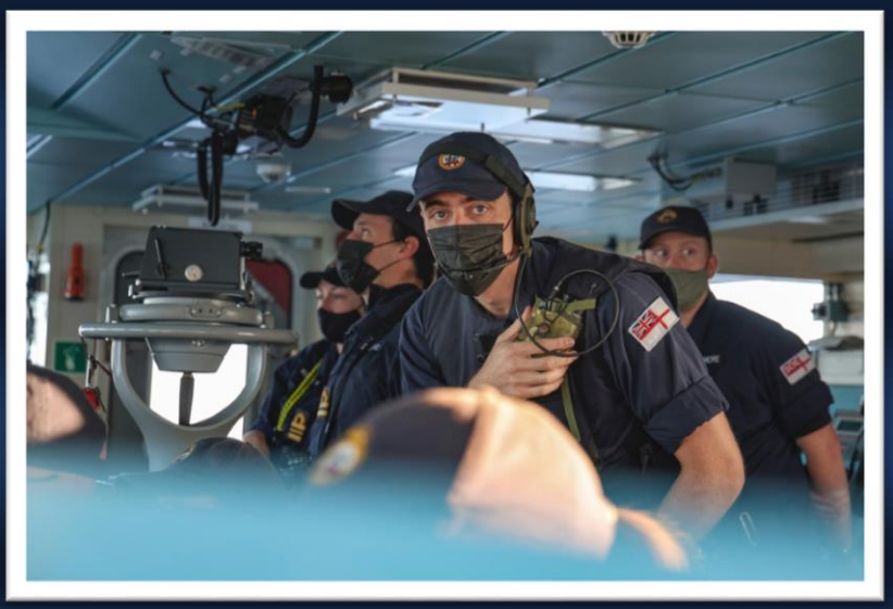
The bridge team during the pilotage along the St John's River to the BAE Shipyard, Jacksonville.