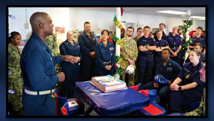
Ship's Company hosted by USS Winston Churchill for presentations to commemorate the atrocities of Pearl Harbour.