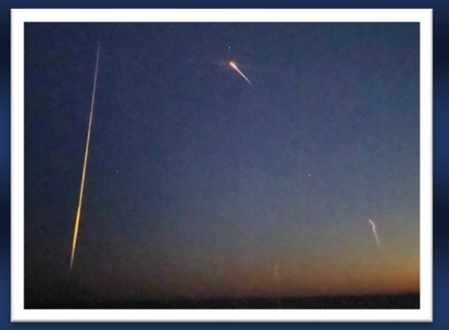
Space X launch from Kennedy Space Centre on the transit North past Miami witnessed at sunset.