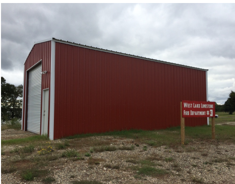
New Substation on FM 3371

First, the Brazos River Authority and Limestone County needed to buy into the idea. Then they agreed to provide the land so we could build the structure, of course, using ESD funds. Now the families in the northeast quadrant of our service area can anticipate improved fire response and a better insurance rating once we get our third fire engine. We also have plans to add a water plant with 16,000 gallons of firefighting water!