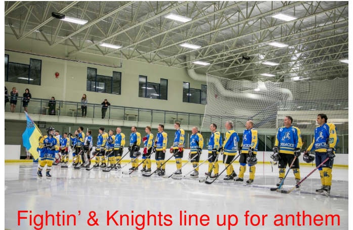
Fightin' & Knights line up for anthem

Please note, the matching dresses seen above are not official UHL apparel.