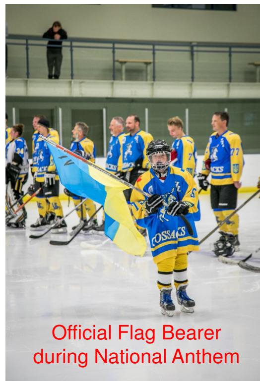
Official Flag Bearer during National Anthem