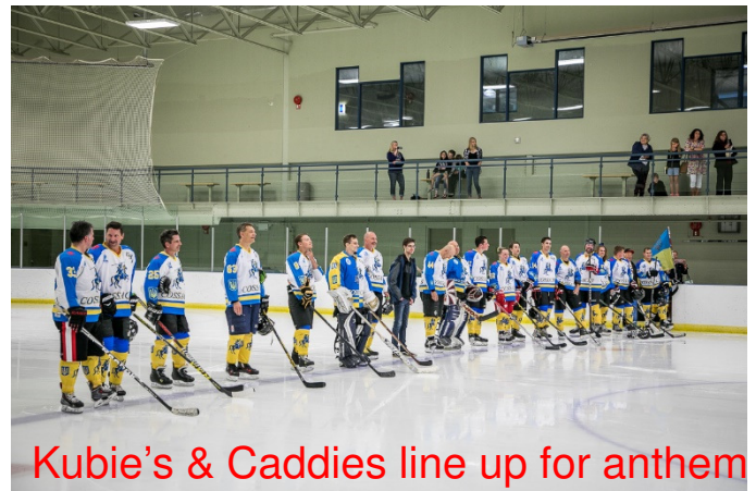
Kubie's & Caddies line up for anthem