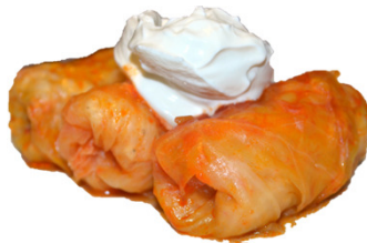
Missing in Action (Rollers... WTF?)