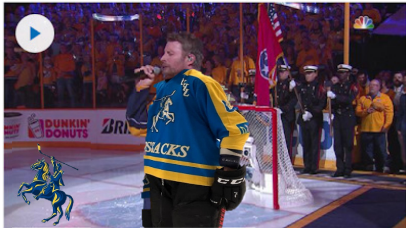
Bentley sings national anthem