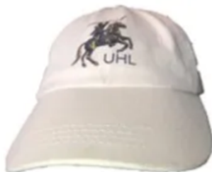
Original Ball Cap