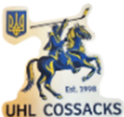
Car Window Decals (7 choices of style)