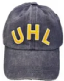
Blue Ball Cap