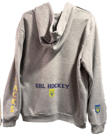
Grey Hoodie (Back)

These photos and products are not Copyright, but they are sole possession of UHL Sports and Entertainment and cannot be used by any man, woman or child for any purpose of any kind. Unlawful use of these photos or products will result in immediate prosecution and Vinny & Gino will be paying users a visit