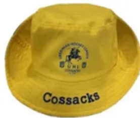
Reversible Bucket Hat