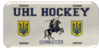
Decorative Front License Plate (6 styles to choose from)