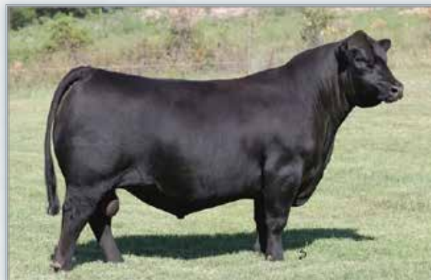
STEVENSON TURNING POINT - SIRE TO LOTS 32-41, 68