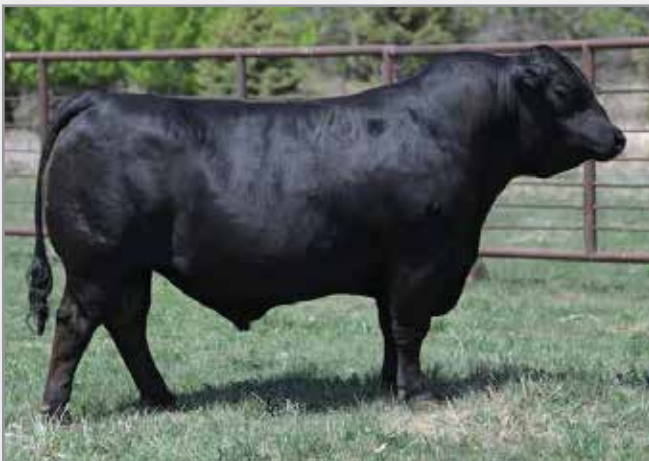
BCLR MANIFESTO - GRAND SIRE TO LOTS 26-28

Lot 26 TAG: 002 | 1/2 SM X 1/2 ANGUS | BLACK ASA#: COMMERCIAL | DOB: 4/11/24 PGS: SIRE: MANIFESTO 7054 PGD: DAM: MGS: CONEALY COMRADE MGD: