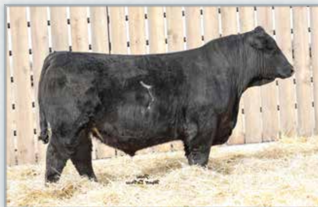
BRIDLE BIT RESOURCE G9117 - SIRE TO LOTS 44-51