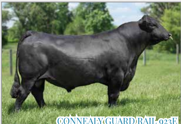
CONNEALY GUARD RAIL 923E SIRE TO LOTS 61-63

This is another great 6400x son. You can't make numbers this good and make the look this nice with a big hip. Tick of white on his belly