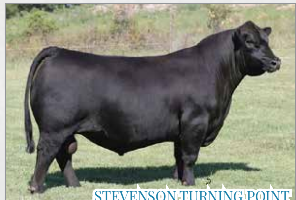
STEVENSON TURNING POINT SIRE TO LOTS 32-41, 68