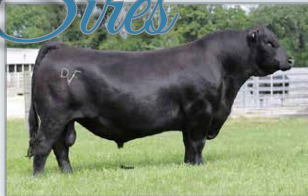
DEER VALLEY GROWTH FUND - SIRE TO LOTS 15-25