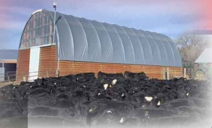
3 loads of Christensen Simmental steers headed to Kimball Livestock Exchange