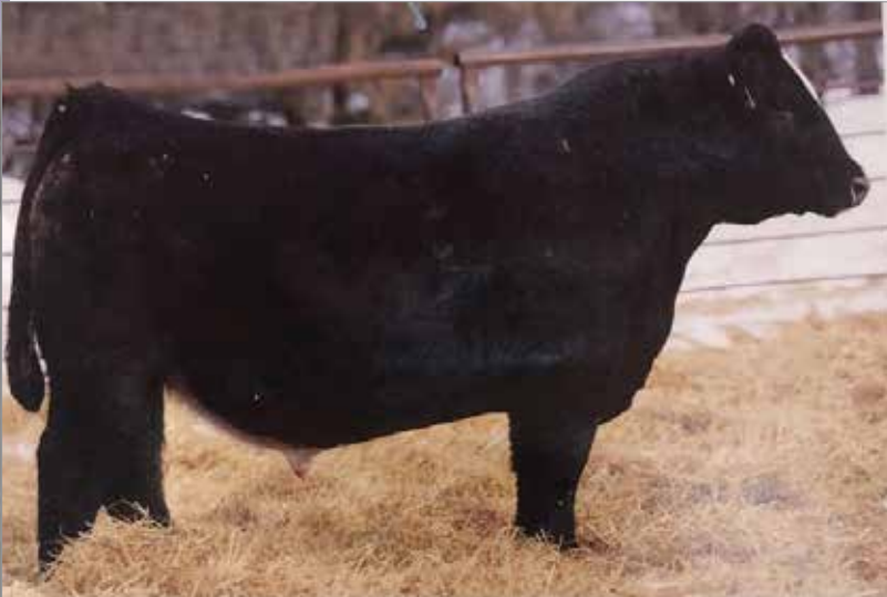
BR TOP TIER - SIRE TO LOTS 42 & 43

Lot 42 TAG: 2211 | 3/4 SM X 1/4 ANGUS | BLACK ASA#: COMMERCIAL | DOB: 4/24/24 PGS: KRJ DAKOTA OUTLAW G974 SIRE: BR TOP TIER PGD: KRDL CAEDENCE C37 DAM: MGS: JF RANCHER 2222 MGD: