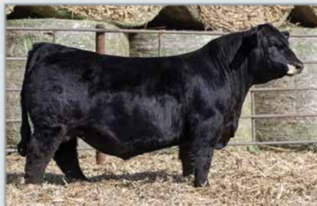
SCHOOLEY KROWN 28K- SIRE TO LOTS 1-7