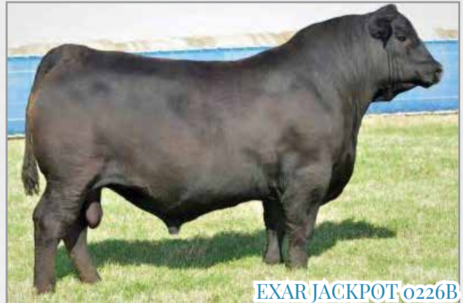
EXAR JACKPOT 0226B SIRE TO LOTS 53 & 54

We went out of element and use this Jackpot Bull and guys he sure didn't disappoint