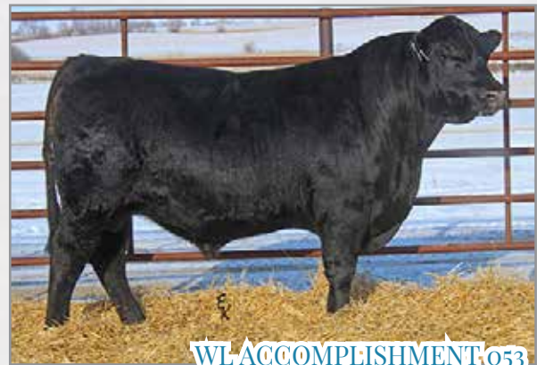
WL ACCOMPLISHMENT 053 GRANDSIRE TO LOT 64