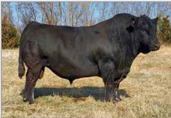
COLORADO BRIDLE BIT E752 - SIRE TO LOTS 74 & 75

This is the youngest bull on the sale. He is keeping up with the older boys. Emblazon cows have great udders