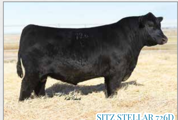
SITZ STELLAR 726D GRANDSIRE TO LOTS 65-67

A larger frame highweaning high gainer that wil produce great feeder cattle.