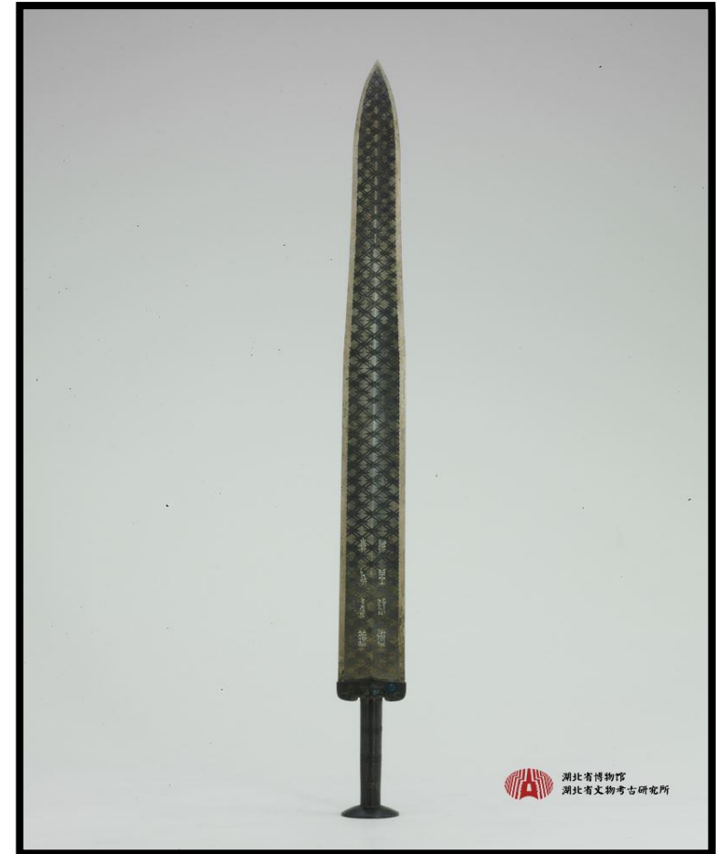
The Sword of Goujian, 56 centimeters long and 5 centimeters wide, from the permanent collection of the Hubei Provincial Museum

Dating back 2,500 years, the hegemon Goujian (r. 496-465 BC) used this shining and rust-free bronze sword to annex the territory of his rivals after twenty years' of humiliation. With exquisite craftsmanship, it is reputed as "the top sword in the world."