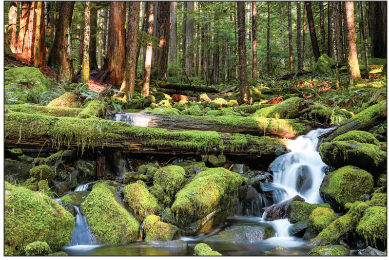
En Route to Sol Duc Falls

You might not know it, but there's another spectacular subject along the way. (More great news!) Halfway to the falls the trail crosses this unnamed creek with an abundance of moss-covered rocks and logs. This photo (below) is hanging on my wall at my left, as I write.