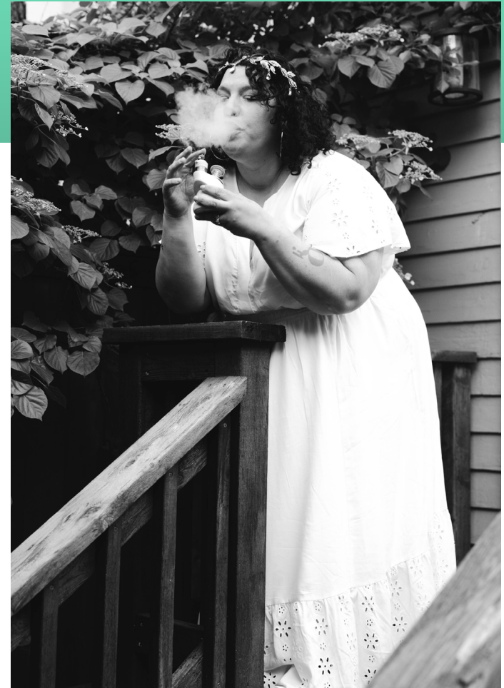
CannaDots product feature produced at The CannaJo!nt.

This is not a hype house. It's a high-vibe hub for the culture-makers and business builders in cannabis.