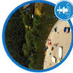
Beach / swimming