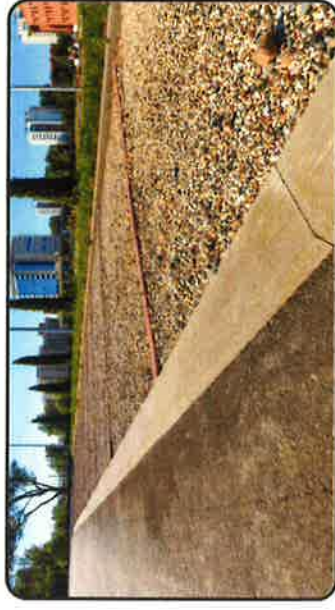
New Parking: Permeable asphalt in roads & Permeable surface in parking spaces