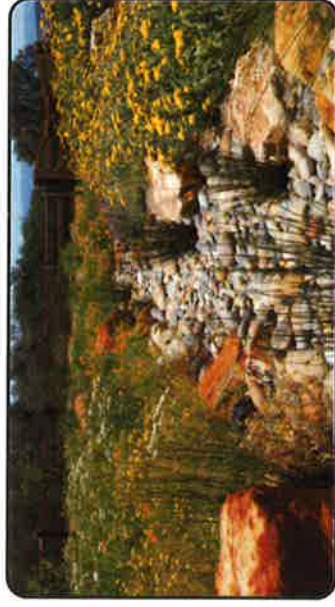
Rain garden / water detention zones.