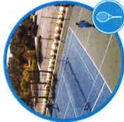
Tennis / Pickleball