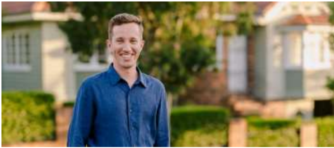
Max Chandler-Mather Greens Federal Member for Griffith