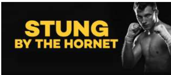
Jeff Horn - The Hornet Professional Boxer