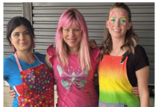
Lovejoy Face Painting