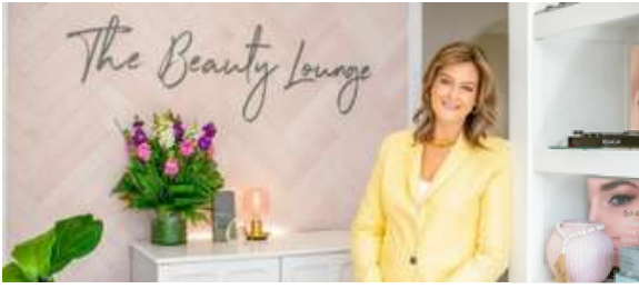
The Beauty Lounge by Louise Becke