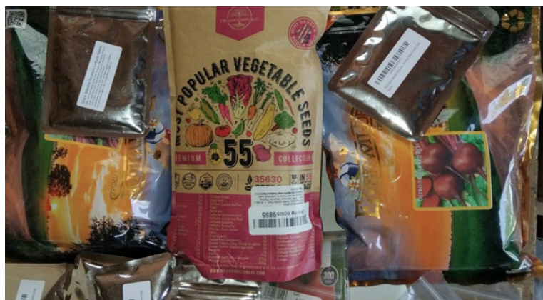
IMAGE OF VARIOUS SEEDS DONATED

This initiative reflects the spirit of Village664: building bridges that lead to real, lasting impact. By linking generous individuals with grassroots organizations, we continue to help grow a stronger, more resilient Montserrat, one seed at a time.